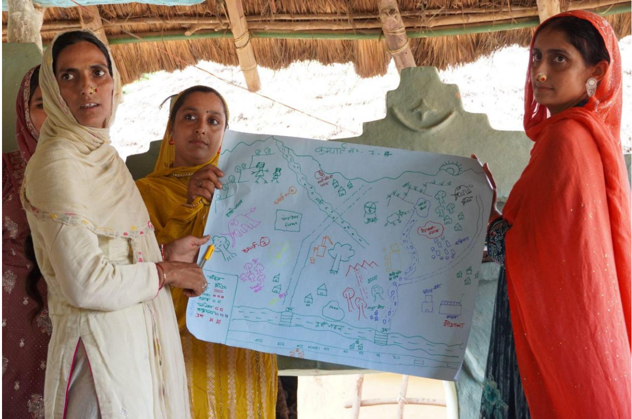
Van Gujjar women presenting a hand-drawn map of the CFR area

The resulting maps reflected not just spatial use but also a layered understanding of coexistence, mobility, and stewardship. During the map presentations, discussions revealed: