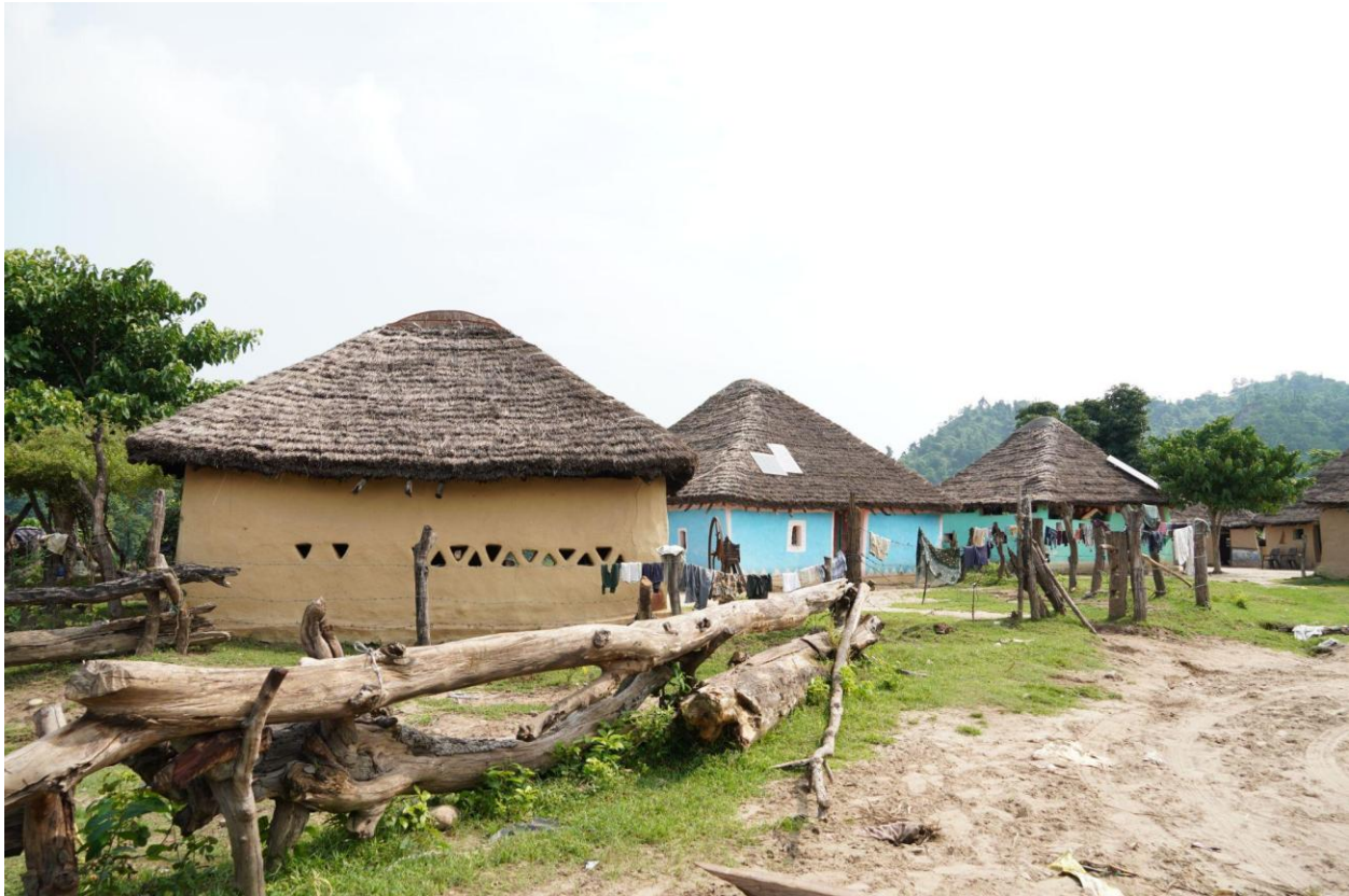
A Van Gujjar hamlet in Golashrot