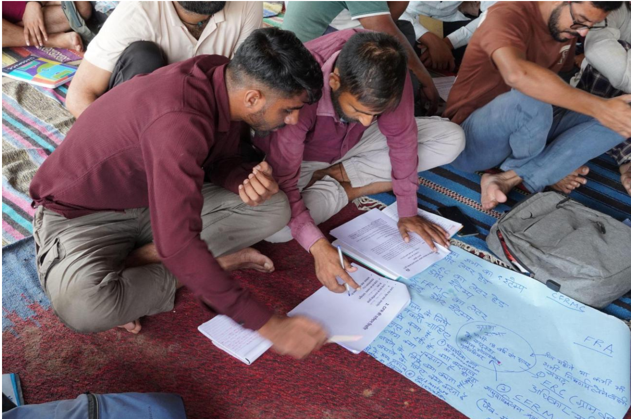
Workshop participants engaging with the Community Forest Resource Management Plan (CFRMP) template

The session was interactive and highly participatory, while being grounded in community experience and shaped by the questions and reflections of the community members who brought lived experience and ecological insight into every discussion. The women and youth of the community raised questions on data collection, intergenerational knowledge sharing, and the role of the CFRMC in enforcement.