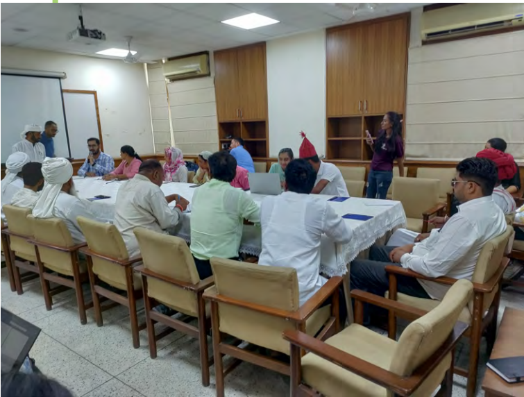
Pastoralist Youth Alliance

The Pastoralist Women Alliance, Van Gujjar Yuva Tribal Sangathan, and Kalpavriksh, with support from the ICCA Consortium, organised a national meeting of pastoralist groups from eight Indian states in July 2024, at New Delhi. The gathering aimed to create a shared platform for community organisations and groups engaged with pastoralist issues. Key sessions included: Introduction and Context Setting; Gender, Youth and Pastoralism; Conservation, Policy and Pastoralism; and a group discussion focused on forming a national-level Sanghatna (alliance) for pastoralists.