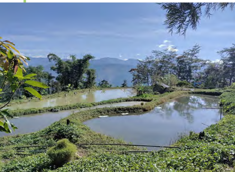
Community fishery pond, Nagaland

In November 2024, Tar became the first village in Ladakh to formally declare a Community Conserved Area (CCA). As part of a capacity-building initiative, representatives from three Ladakhi villages—Tar, Saspoche, and Nyaraks—along with members from Snow Leopard Conservancy and Kalpavriksh, undertook an exchange visit to Nagaland to learn from long-established CCAs in the region. The visit included interactions with CCA communities in Longleng, Noklak, Sendenyu, and Khonoma, and participation in a regional workshop hosted by Choklangan village that brought together nearly 50 villages.