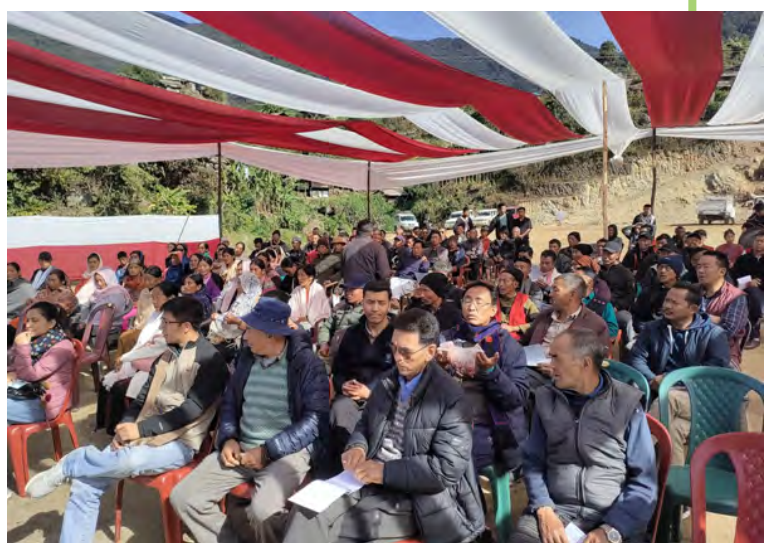
Eastern Nagaland Community Conserved Areas' Meet, Choklangan

The workshop culminated in a vision for a larger landscape-level conservation effort and the formation of Eastern and Trans-Border Biodiversity Peace Corridors. Cultural performances and local product exhibitions showcased the region's rich heritage. The event concluded with messages of solidarity and a collective commitment to expanding and strengthening the CCA movement in Eastern Nagaland.