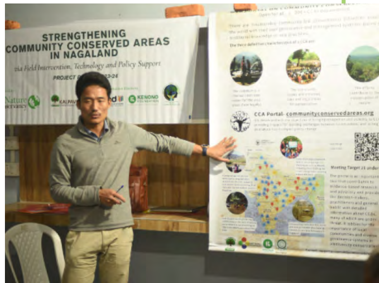
Presenting the CCA portal to NCCAF borad members

Kalpavriksh is currently supporting one person to coordinate the CCA documentation of member CCAs of NCCAF.