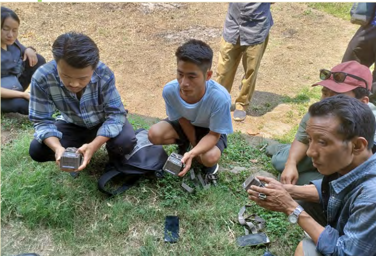
Camera trap training, Gaili CCA, Nagaland

Kalpavriksh, along with local partners Kenono Foundation and Lemsachenlok, and supported by The Nature Conservancy started an on-ground project in Nagaland focused on strengthening the ability of communities and organisations in the state to protect and manage their CCAs.