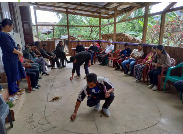
Resource mapping exercise in Choklangan CCA, Nagaland

Spatial boundaries were documented, and a community-led biodiversity monitoring plan was developed and implemented by training local resource persons. Biodiversity surveys using camera traps and interviews, along with community perception studies on human-wildlife conflict were undertaken.