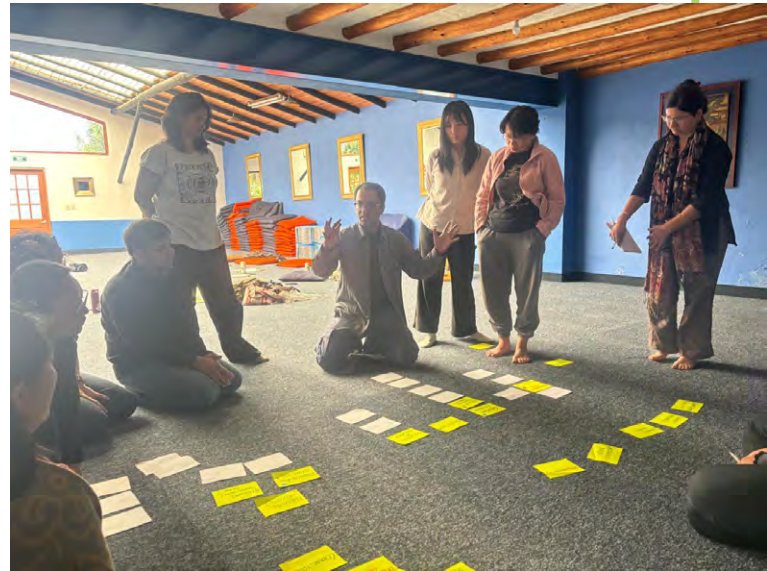
Kalpavriksh members involved in ICCA Consortium organisational change process

Kalpavriksh has initiated support for a Legal and Policy Coordinator to lead legal and advocacy efforts focused on rights-based conservation. Key responsibilities include drafting a policy paper on land and forest governance in Arunachal Pradesh in relation to the Forest Rights Act (FRA), conducting awareness and training sessions for local communities, and organising state-level workshops on legal safeguards for CCAs in light of recent amendments to the Forest Conservation Act—particularly