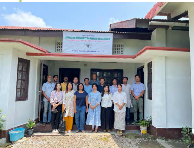
Opening of NCCAF office

The NCCAF serves as a state-wide platform for CCAs to exchange knowledge, build capacity, and gain visibility in national and international forums. Kalpavriksh supports three fellows who coordinate activities among affiliated CCAs, provide support in policy advocacy, skill development, and community representation, and support the forum to strengthen the collective voice of Nagaland's CCAs in governance and conservation dialogues.