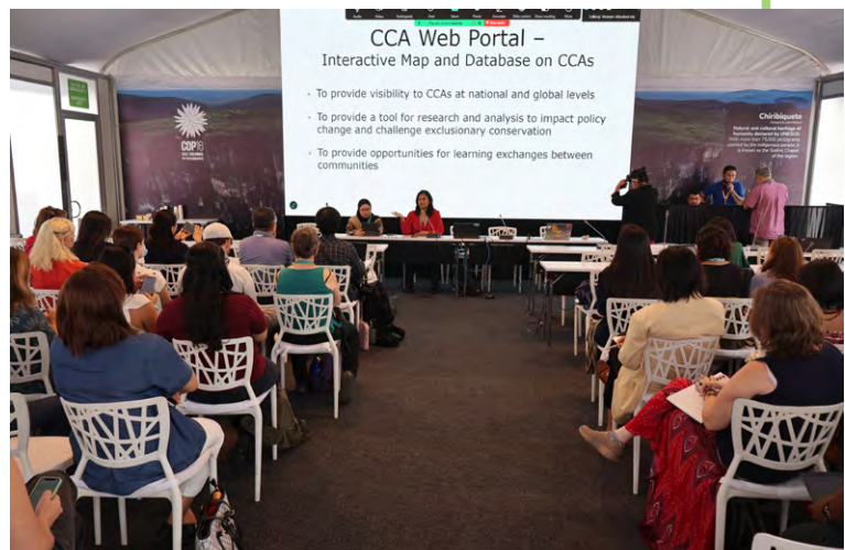
Presenting CCA documentation work at a side event on Women, Citizen Science and Biodiversity Conservation at CoP 16, Cali