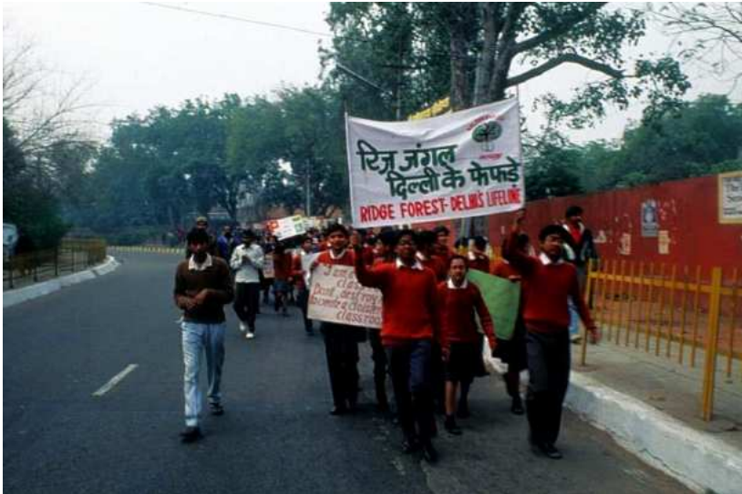
School students rally for protection of Delhi Ridge forest, 1979

“Kalpavriksh is composed mostly of students who got together in 1979 to act against the visible deterioration of Delhi’s environmental condition. We had been feeling increasingly angry and frustrated at our learned elders, many of whom expressed concern about the environment in seminar after seminar, yet did nothing about it. The Indraprastha Power station continued to belch out tonnes of pollutants everyday and Delhi’s largest stretch of forest, the Ridge, continued to get smaller. So we decided to act. Taking the proposed large-scale construction on the Ridge as our focal point, we along with local residents held, in October 1979, a large rally demanding an immediate stop to all encroachments. Our protest was however obscured by the political turbulence of the period. It did serve to bring us together as an action group with an aim to do our bit in securing a more liveable environment.”