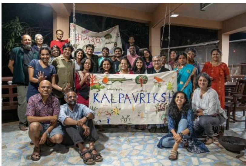
KV old and new members at 40th anniversary gathering, Kolad (Maharashtra), 2019

For over 40 years, Kalpavriksh has continued to exist in the environmental and socio-political non-profit space. In this time it has shaped and been shaped by the people who have been a part of it, and by the groups, movements and people it has collaborated with. We end this account of KV history with a scattering of thoughts shared by a few KV members on what has kept KV alive and what the future may hold.