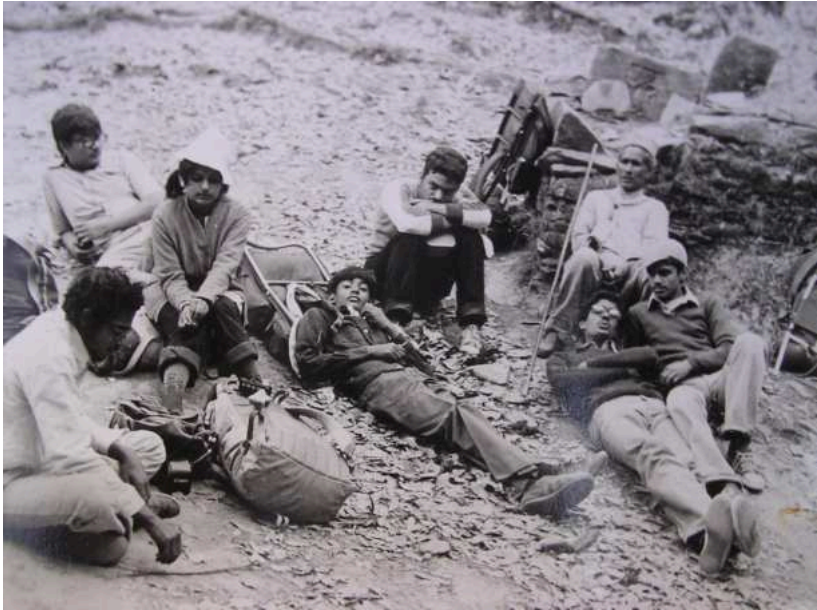
KV padayatris in Tehri Garhwal, 1980

Two Padayatras (footmarches) through Garhwal in 1980-81 helped the members understand the socio-environmental impacts and gender dimensions of deforestation in the hills, especially through interactions with activists of the Chipko movement.