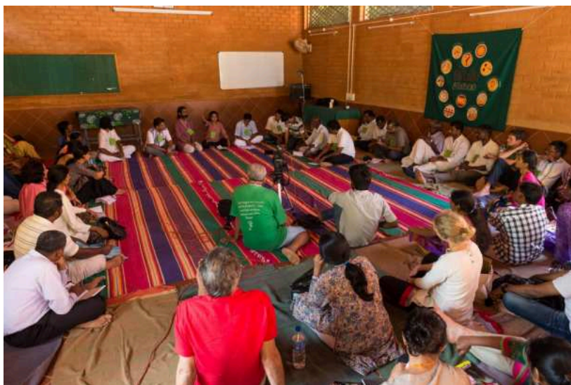
Tamil Nadu Vikalp Sangam, 2015