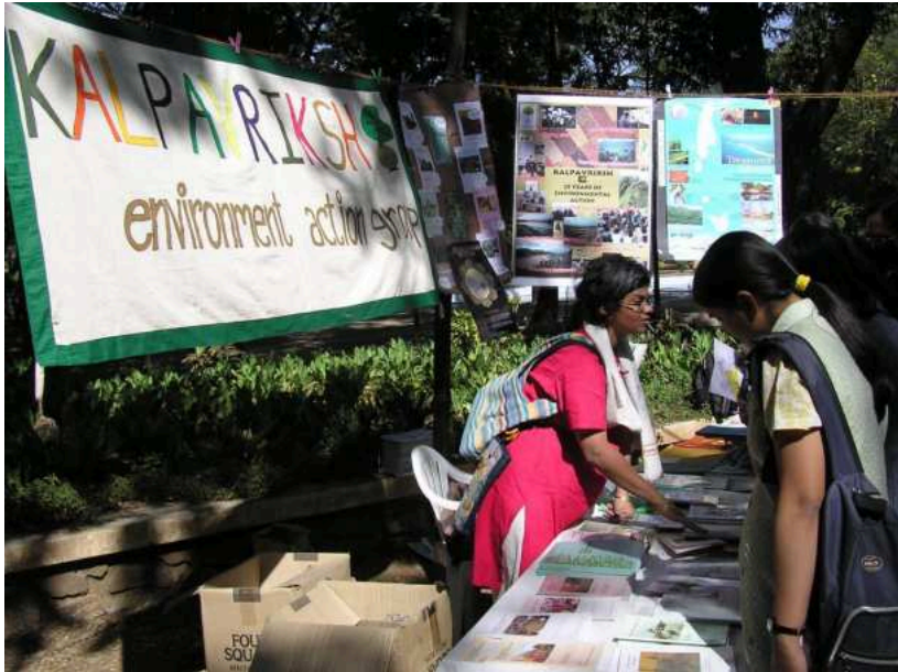
Eco-mela on KV's 25th anniversary, held in Pune (Maharashtra)