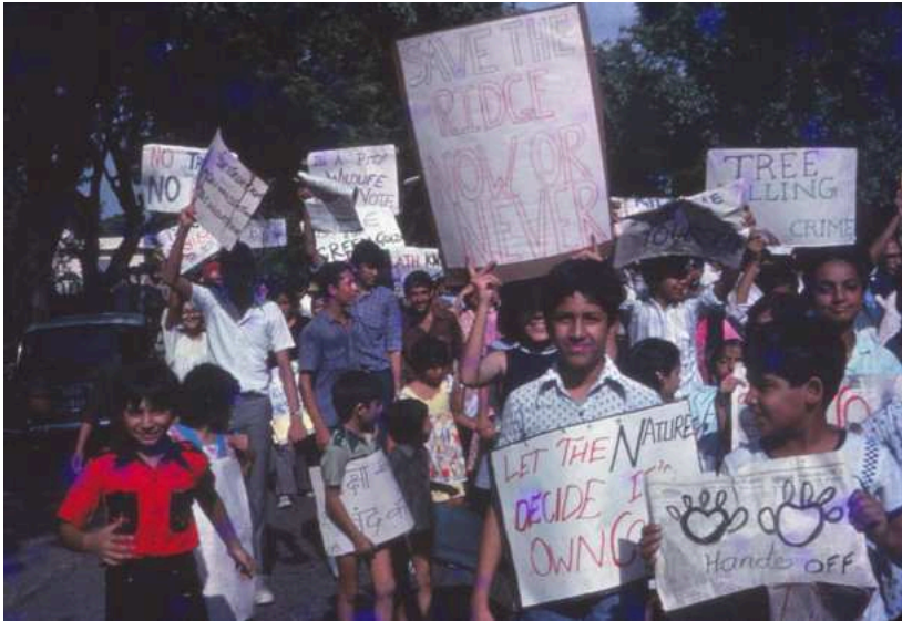
Demonstration against destruction of Delhi Ridge forest, 1979

The 1979 ridge protest with its 250-300 participants started a long-drawn process of citizen engagement on the issue of protecting urban green areas in Delhi. Favourable media coverage of the rally, increasing citizen's pressure and finally a memorandum presented to the Prime Minister in 1980 helped in getting the Ridge and other green areas declared 'Protected Forests'.