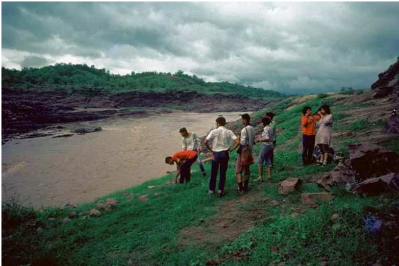
KV and Hindu College Nature Club members on Narmada trek, 1983

a strict budget of Rs. 15 per person per day, the trekkers still remember the luxury of the caramel pudding prepared for them by a care-taker at the NSP guesthouse in Harsud, ‘a face reader of sorts’, 26 who insisted that ‘Subhash Chandra Bose was alive and would come back to save India’. 27 During the trek, they studied the environmental implications of the massive irrigation and hydel projects coming up in the Narmada Valley. They saw beautiful forests and temples that would come under submergence. They also visited groups working in the region such as Mitti Bachao Abhiyaan in Hoshangabad and Friends Rural Center in Rasulia, thereby connecting with diverse organisations and networks.