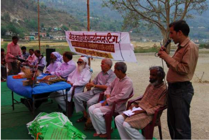
Bej Bachao Andolan with several Chipko activists, Nagani (Uttarakhand), 2010