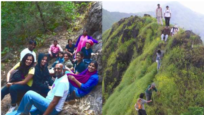
KV members on nature outings in/around Pune

In 1986, KV began discussing structural reorganisation for greater efficiency. The group decided to appoint project coordinators who would be responsible for regularly reporting to the General Body or GB and for involving other members in the project. For the first time, it was decided that members could be paid for their work. The internal newsletter of September 1986 reports on the ‘historic decision’ of the General Body: