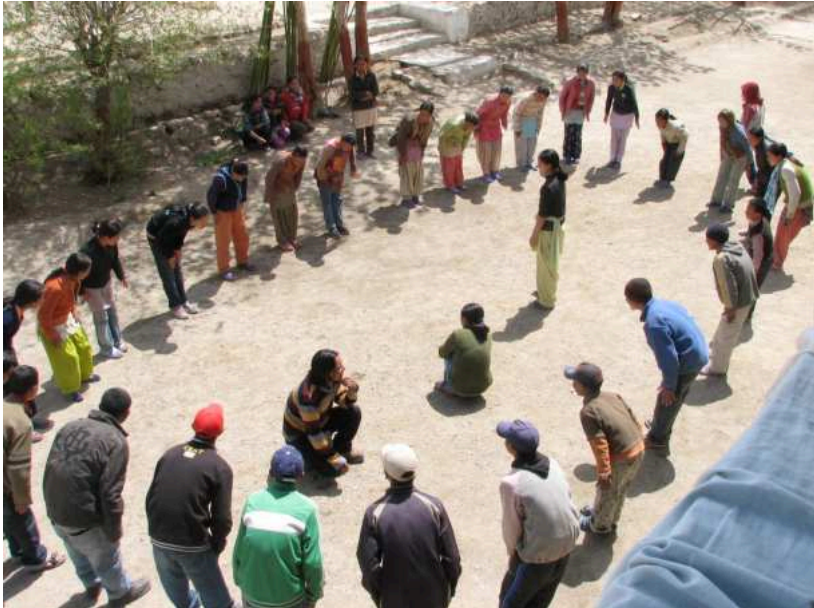
An outdoor energiser activity, Zanskar, 2007

private schools, some accessible by road and others that were not. During this phase a number of educational resources and activities were developed as well as local youth employed as environment educators.