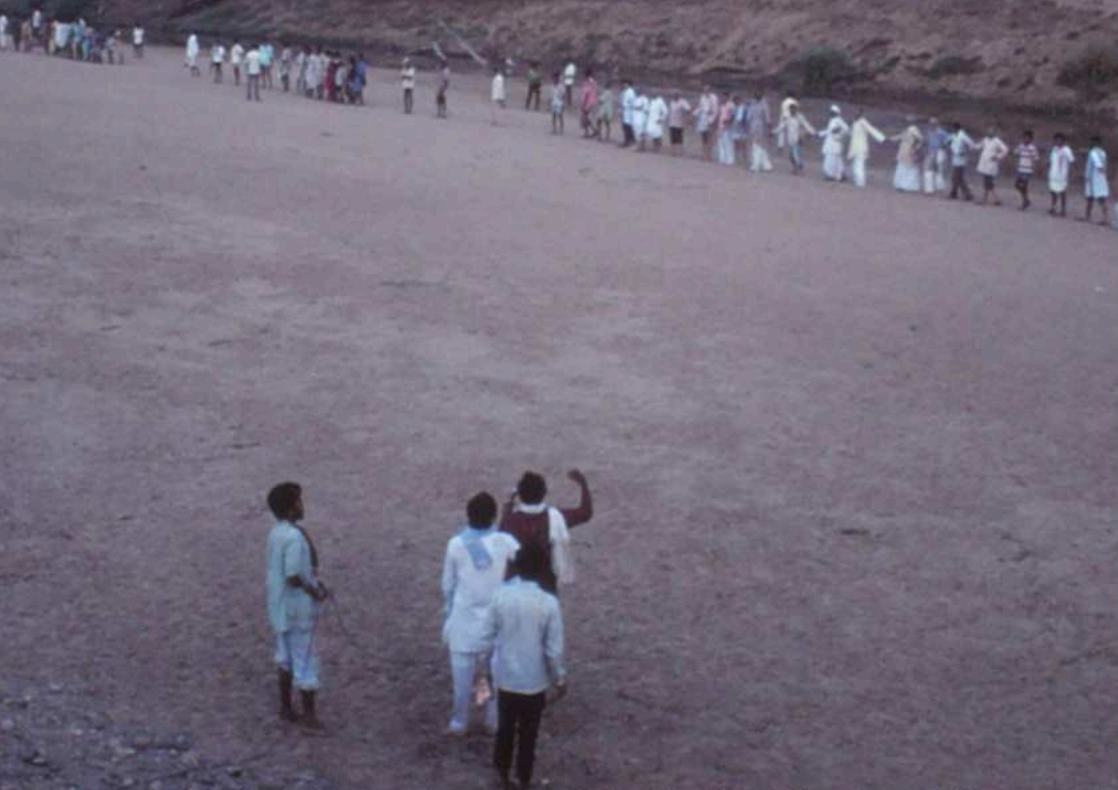
Rally against hydropower projects on Indravati River, Hemalkasa (Maharashtra), mid-1980s