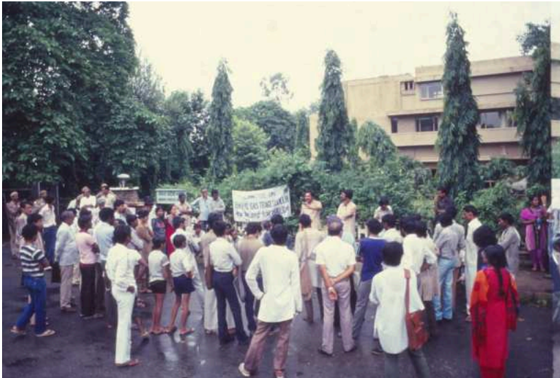
KV members joining a demonstration on the Bhopal gas tragedy, in Delhi, 1985

The Bhopal Gas Tragedy of 1984 was another event that shook the nation and deeply influenced several members within KV who extended solidarity to the local protests. KV joined the Delhi Committee on Bhopal Gas Tragedy, taking part in one field investigation in Bhopal, but eventually withdrew due to its becoming particularly directed against one political party whereas KV members wanted to ask more structural questions.