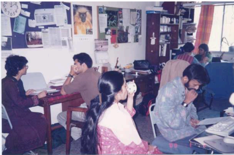
KV Pune office, early 2000s

A draft note on the working philosophy of KV was discussed during the 2004 AGBM for distilling and articulating the principles of functioning such as voluntarism, non-hierarchical functioning, minimal and equitable pay, democratic decision making, and small organisational scale. During the discussions, the members emphasised the need to focus on networking and partnership rather than upscaling, and the need to build ‘indicators of alarm’. This ‘philosophy’ note is discussed and updated as the need arises every once in a few years in the AGBM, becoming a source of collective reflection with questioning and discussions on many of these principles happening time and again.