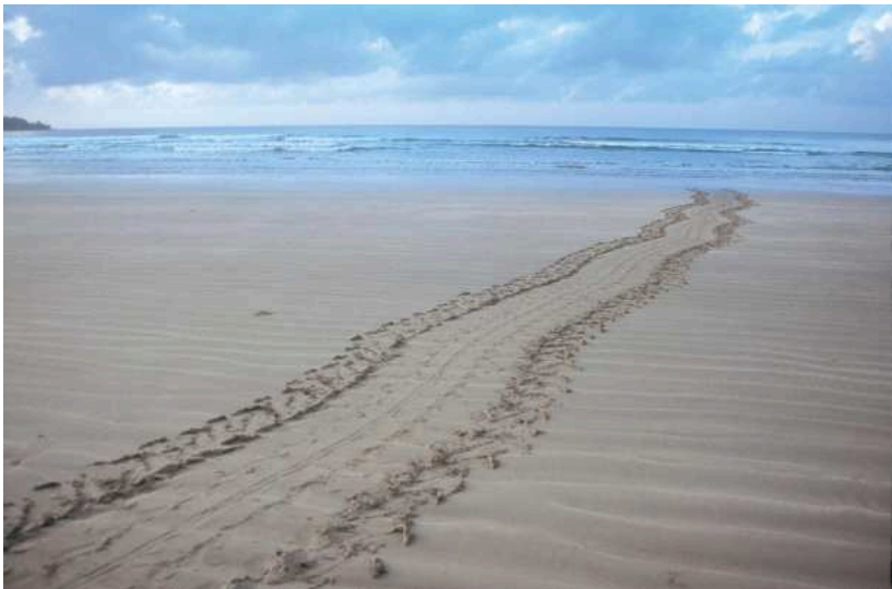
Turtle tracks on a beach in Andaman and Nicobar Islands, 2002

KV has had an understated but remarkable history of engagement and participation in the environmental and social activism landscape in India through its different activities spanning over four decades. A snapshot of KV's trajectory and growth over these 40+ years is provided here. The themes are roughly divided into the five major focus areas, while acknowledging that the work actually coalesced into distinct and separate themes only in the late 1990s.