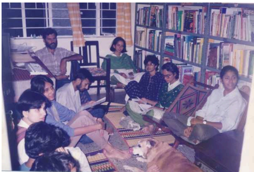
KV members in the early years of the Pune office, late 1990s

At present, KV Pune has weekly office meetings for discussing administrative issues and sharing project updates. For decisions related to funding, collaboration or endorsement, there is also usually a mail to the mailing group of all members. Occasional emergency decisions are taken in the core group meetings.