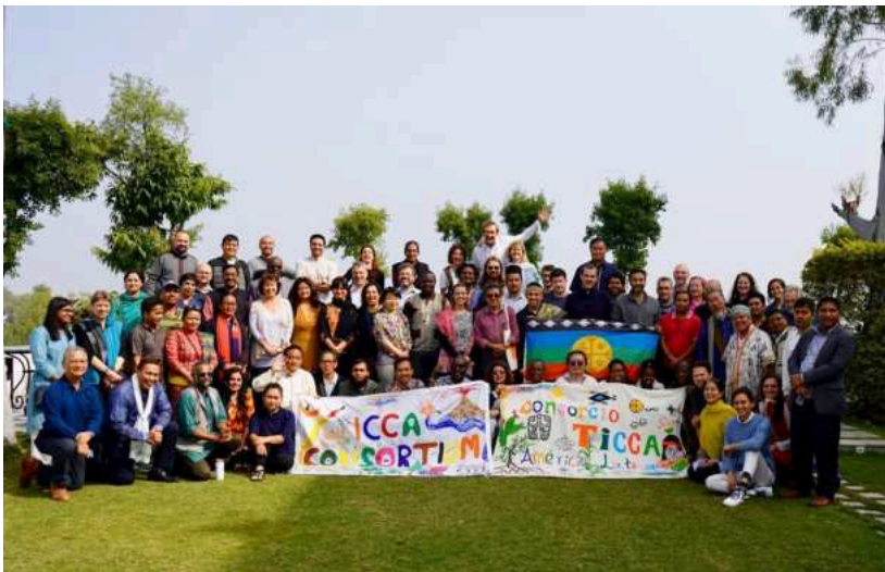
ICCA Consortium 15th General Assembly - Udaipur, Rajasthan, 2019

of the People and Equity theme in World Parks Congress (2003) and facilitated participation of several community representatives in the international gathering. KV was also instrumental in including Governance as a key element of the CBD Protected Areas Programme of Work (2004), and introduction of the concept of CCAs into international policies of the IUCN and the CBD's Programme of Work on Protected Areas. In 2004, KV published Participatory Conservation: Paradigm Shifts in International Policy . From 2007 to 2012, KV hosted and serviced the funds of the CBD Alliance, an international network of civil society organisations that KV had helped set up in 2002, for monitoring developments around the Convention of Biological Diversity. As part of this role, it facilitated advocacy and participation of indigenous and civil society persons in CBD related meetings.