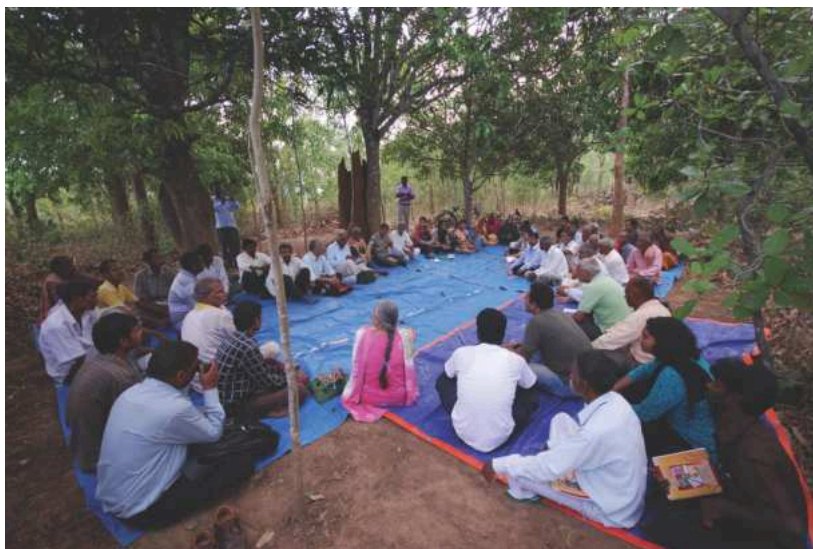
Community gathering on Forest Rights Act in Odisha

Tadoba, Kalu Dam in 2013) and several issues of Citizen's Report on Community Forest Rights over the years. Since that time, KV has also been involved in sustained Maharashtra level advocacy on forest rights and documentation of post-recognition processes.