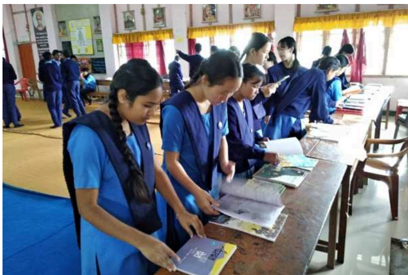
KV books at the Joy of Reading Festival at Roing in Arunachal Pradesh, 2018

In collaboration with Last Wilderness Foundation, KV developed two games (Jungle Dominoes and Wildlife Bingo) and Secrets of the Jungle , an activity book for children on the flora and fauna of Central India. The resource materials were jointly published with LWF in Hindi and English in 2016.