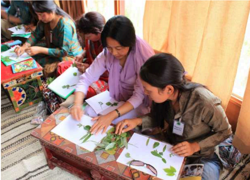
School teachers try out the 'Leaf Zoo' activity at a teacher training programme held at Likir, Ladakh, 2011

human-wildlife conflicts with the snow leopard. Within a few years, Eklavya translated and published the story in Hindi and Himalayan Trust translated and published it in Nepali.