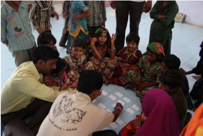
A session in Kachchh for kids using the material developed, 2014

Kalpavriksh collaborated with NGOs in Kachchh (Sahjeevan and Kachchh Nav Nirman Abhiyan and Khamir) from 2012 to 2015 to develop localised environmental education material for children in the district. This work was funded by Reach to Teach.