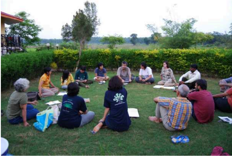
KV AGBM at Tadoba, Maharashtra, 2010

led to preparation of a draft terms of engagement by the Core Group which was read out and agreed upon in the AGBM of 2013.