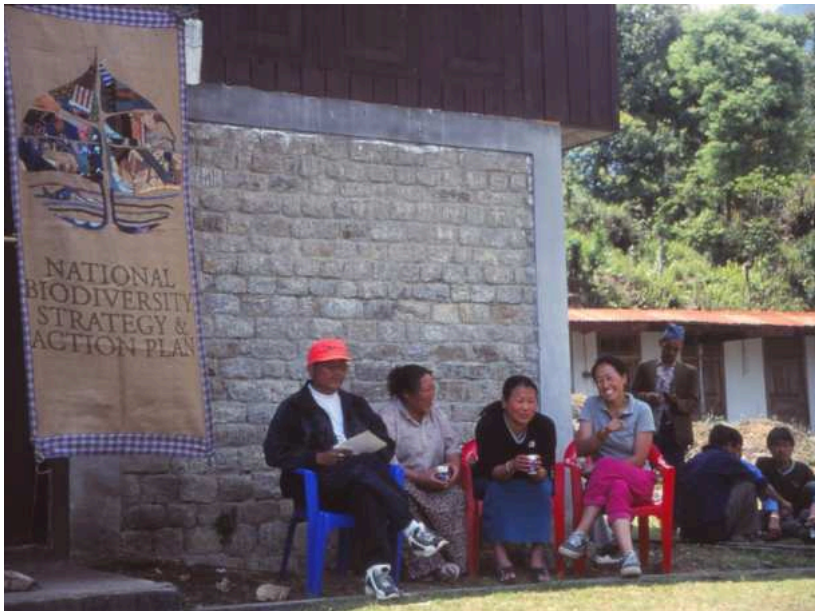
NBSAP event in Yuksom, Sikkim, 2001

livelihood security, a vast array of issues were covered such as threatened ecosystems and species, indigenous seed and livestock diversity, the economics and valuation of biological resources, ethical and spiritual links of humans and nature, the livelihood rights of fisherfolk, farmers, adivasis, and pastoralists, land and resource tenure patterns, and development and governance patterns affecting biodiversity and nature.