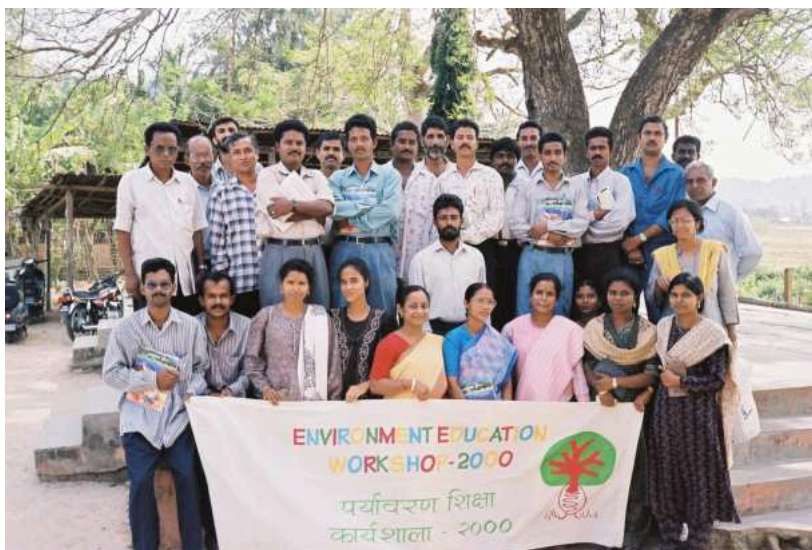
Teacher's group along with some Kalpavriksh's members, 2000

In 1989, KV began its involvement in the environmental problems of Andaman and Nicobar Islands in collaboration with the Andaman Nicobar Environment Team or ANET. At the request of ANET, KV began work on its first localised education module with the objective of facilitating teachers in providing context-specific and place-based environment education to the students residing in the Andaman and Nicobar islands.