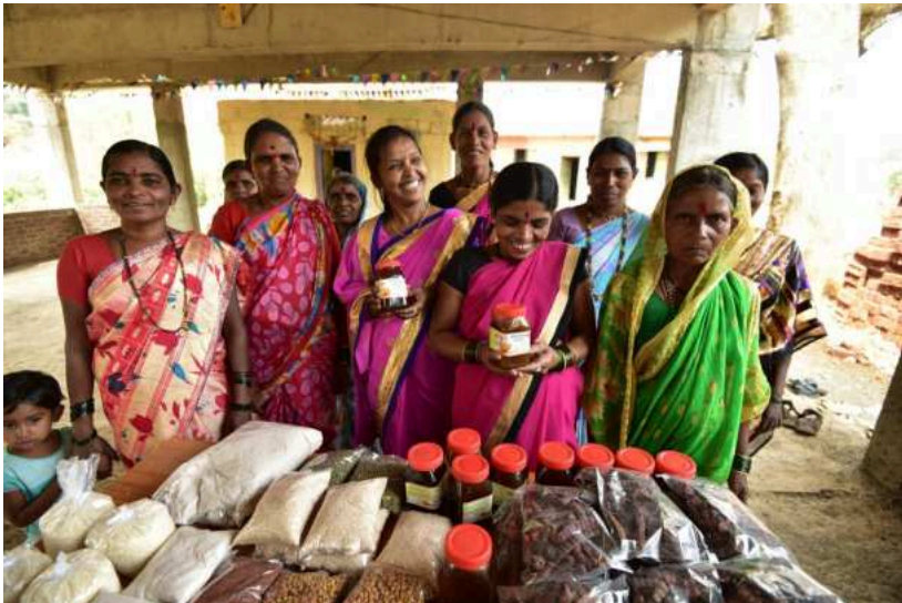
Women's livelihoods and self-group in Bhimashankar, Maharashtra, 2019

Although KV carried out case studies at various sites and regularly engaged with the communities at several of its field sites, its engagement with villages in and around Bhimashankar Wildlife Sanctuary since 2007 has been one of the few long term sustained grass-roots level interventions.