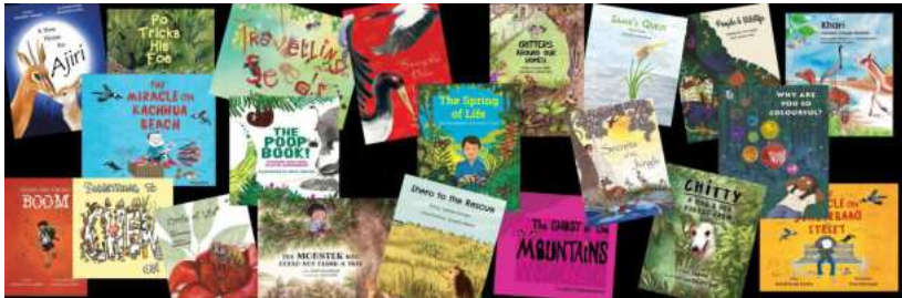
Books for kids on wildlife and nature... collage @ Tanya Majmudar

children's storybooks connected to issues of wildlife, environment and society.