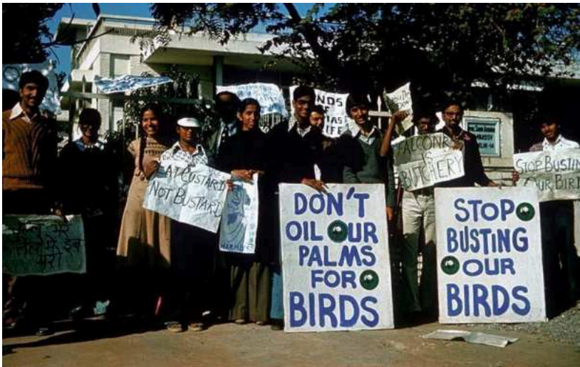
Pre-Kalpavriksh demonstration against bustard hunting by Saudi Arabian princes, outside Saudi Arabian embassy, Delhi, 1978

These words are taken from an early pamphlet of Kalpavriksh, now yellow with the passing of four decades. While the Ridge forest rally is considered as the official beginning of KV, many of the youth involved had already been active in environmental awareness or action. They had been involved in at least two actions in 1978-79 that can be considered as precursors of KV—a demonstration against permission given to Saudi Arabian princes to hunt floricans and bustards, and a meeting with PM Morarji Desai regarding export of rhesus macaques.