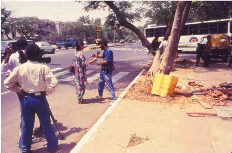
Briefing media about de-tiling action by KV, early 1990s

KV’s activities in Delhi have steadily declined over the years. Due to there being hardly any members working full-time on KV projects in Delhi, the Delhi office had to be shut down in 2012. Yet, some ‘urban environment’ activities continue.