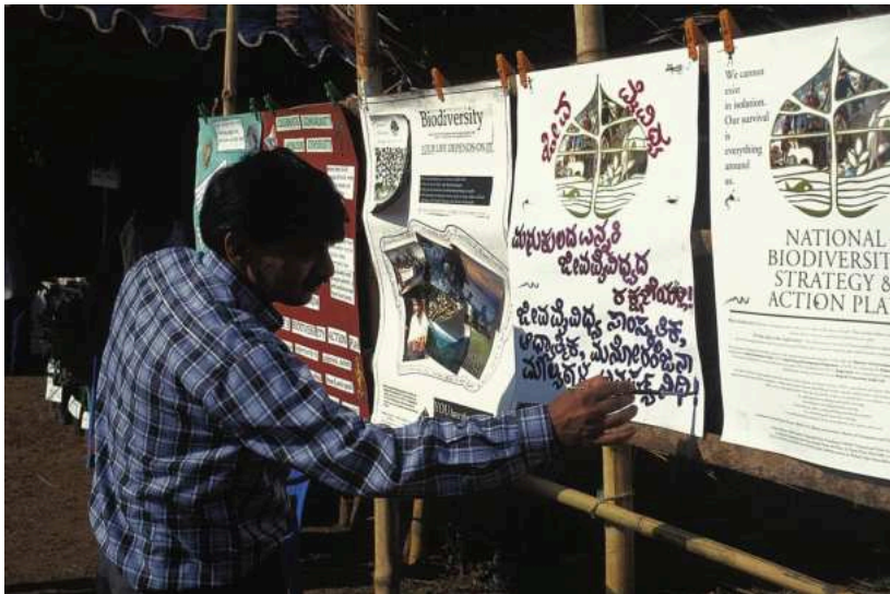
Sirsi biodiversity mela (NBSAP), 2001

As a spin-off from a Kalpavriksh Conservation Education (CE) project funded by FES, The Malnad Home Garden and Seed Exchange Collective in Sirsi came into being in 2001 with the NBSAP Biodiversity Mela in Sirsi. While the project itself looked at the sort of CE inputs that would work in the ecologically and culturally very unique Malnad region of Karnataka's Western Ghats, the seed collective initiative began as a non-formal way of learning and involving women as vital sources of information and teaching directly from their homes.