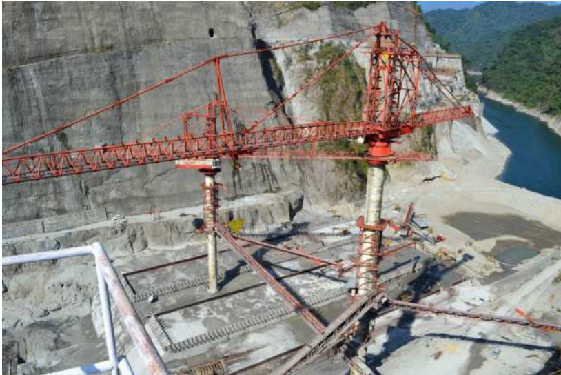
Lower Subansiri dam, Arunachal Pradesh, 2001

persons in various capacity building programs on environment and legal issues by local groups in Northeast India, at times co-organised with youth or student groups. By 2004-05, KV actively tried to get attention to the impacts of the spate of hydel power projects in the Northeast on biodiversity as well as the overall way of giving environmental clearance to various development projects. It has also since then provided support to local groups in the Northeast regarding environmental and social aspects of dams and for advocacy at the regional and national levels regarding the same.