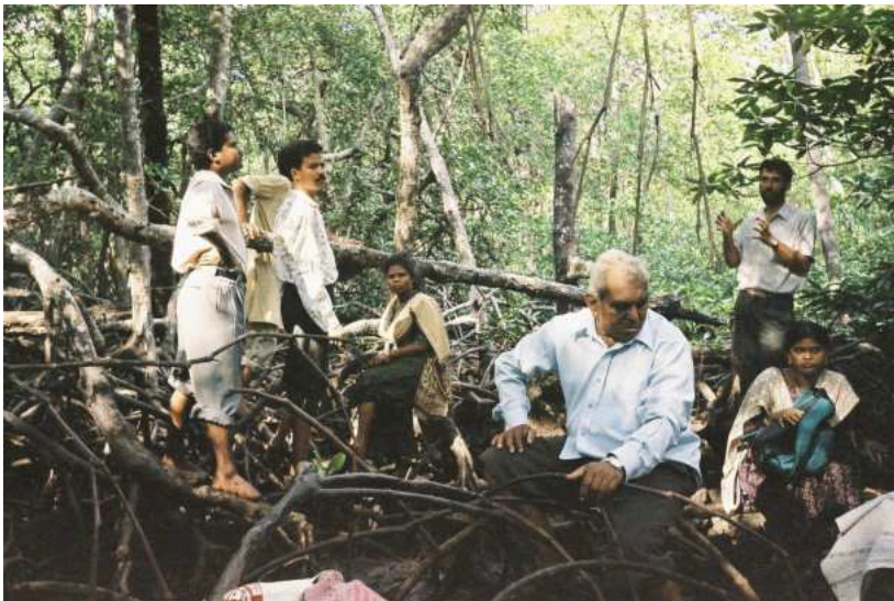
Teacher's workshop with Treasured Island on Havelock Island, 2000

logging and its ecological and cultural impact in the region. In 1993-1994, KV participated in the campaign led by Society for Andaman and Nicobar Ecology (SANE) for opposing reintroduction of European bass around the seas of the island. In 1999, along with two other NGOs (BNHS and SANE), KV filed a legal intervention in the Supreme Court to protect the Onge tribe from destruction. The intervention was later expanded to include various environmental issues of the Andaman and Nicobar islands.