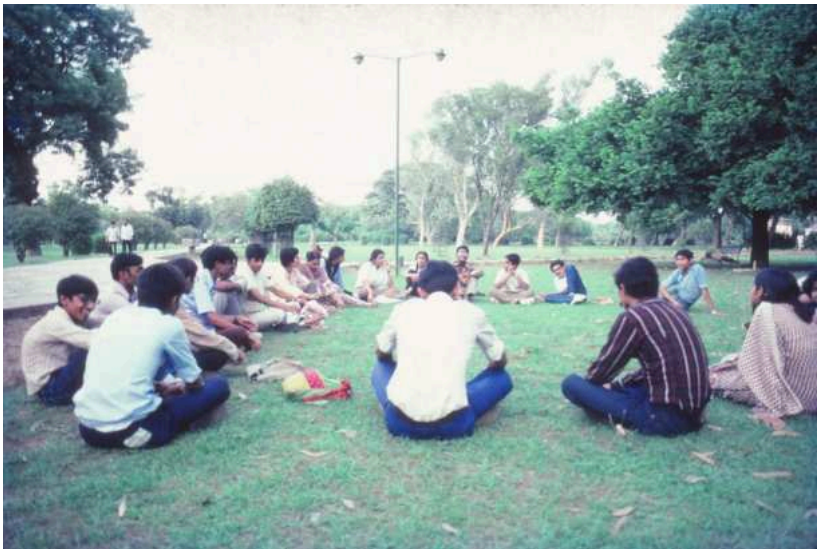
KV meetings in the early 1980s were held in parks of Delhi

Soon peoples' issues became centre stage and a network of links began to emerge...of individuals and a wide range of institutions. Our consciousness was developed through ideas of small scale and human scale of E. F. Schumacher and the seminal ideas on politics and people like Rajni Kothari. Many of the members seamlessly moved in and out of Centre for Science and Environment, Gandhi Peace Foundation, Lokayan and other organisations debating ideas, attending meetings, participating in protest marches etc. Some contributed to the making of the first ever citizen's reports on the State of India's Environment in 1982 and 1984.