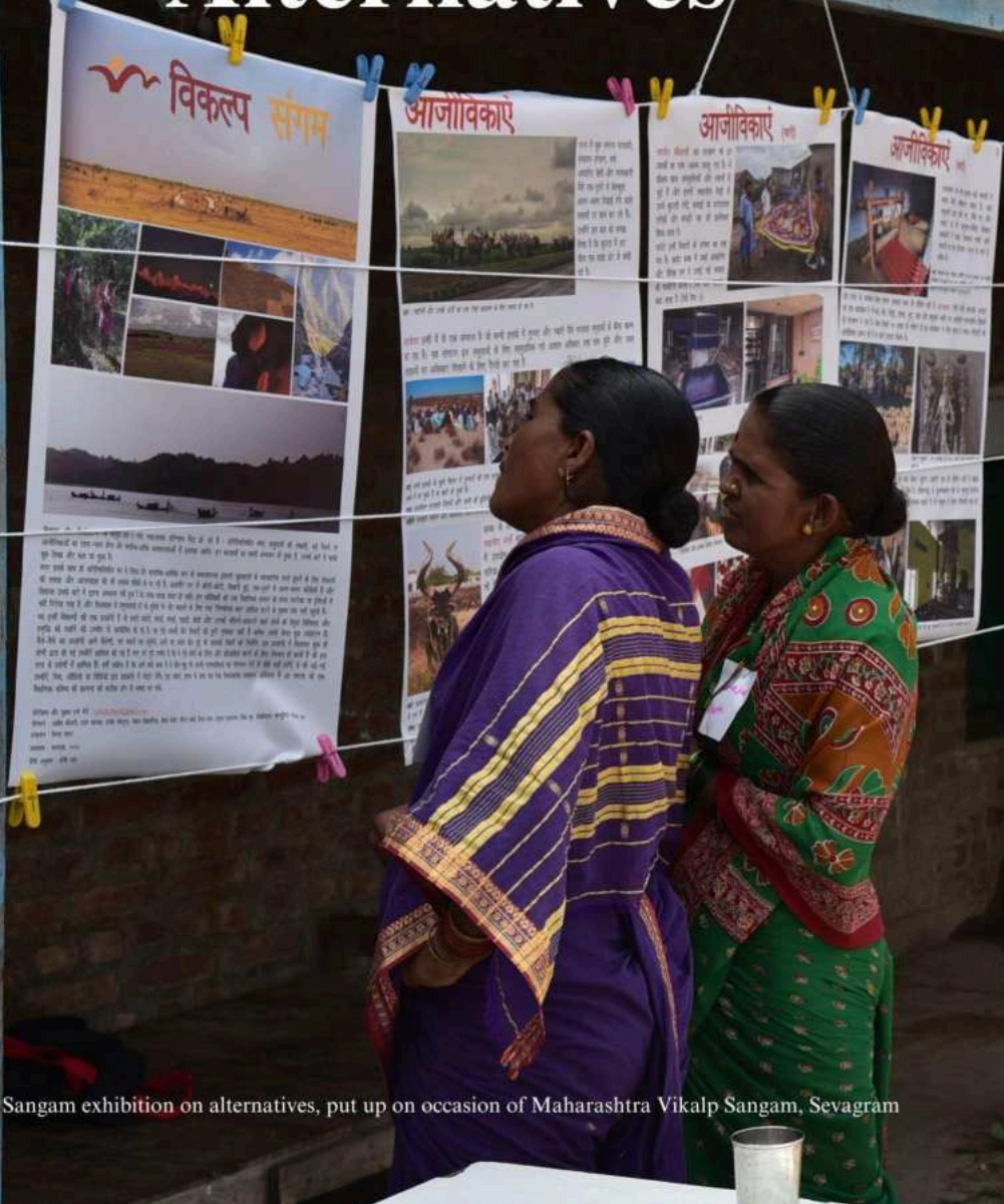
Vikalp Sangam exhibition on alternatives, put up on occasion of Maharashtra Vikalp Sangam, Sevagram