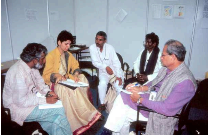
KV facilitating community participation at World Parks Congress, Durban 2003