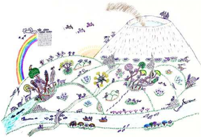
Below the volcano, July 2020

In that Extraordinary General Board Meeting or EGBM, it was discussed that there is nothing wrong in taking up funded projects but these should not dictate KV's course of action and should be limited in size 'because large projects (that require extensive infrastructure) could lead us into becoming institutionalised and bureaucratic.