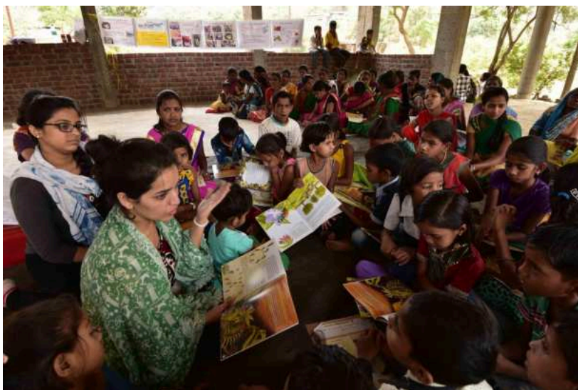
Children's book reading to adivasi kids in Bhimashankar, Maharashtra, 2017