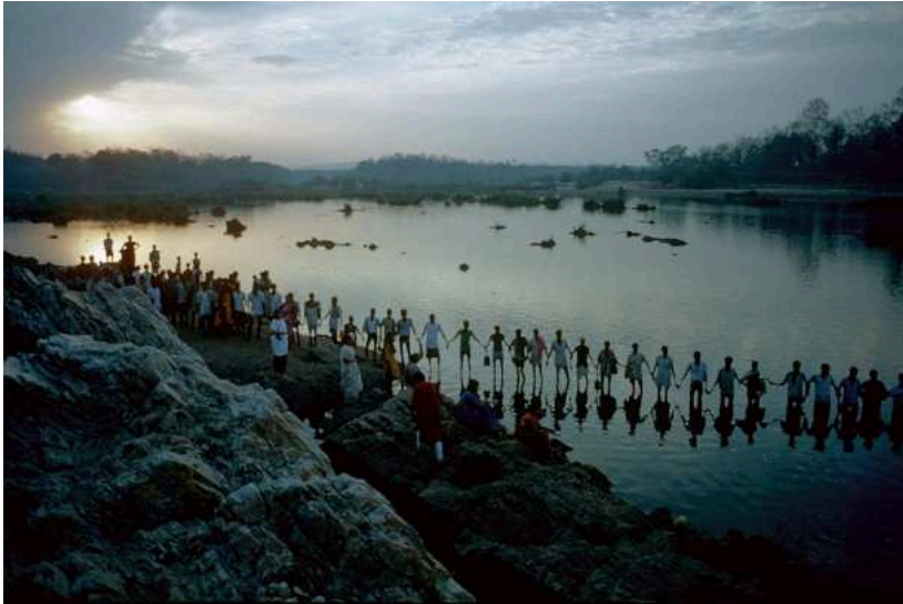
Human chain at Hemalkasa (Maharashtra) across Indravati River, protesting proposed hydroelectricity projects, 1989

follow-up decision to be a part of a 'Vikalp Samiti' with twin ideas of joint action and a discussion forum on environment and development.