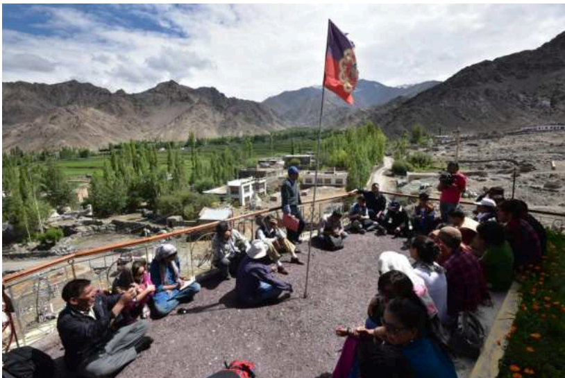
Field trip to Saboo during Ladakh Vikalp Sangam, 2015

A core group of organisations and individuals committed to the process was formed. Since the first sangam at Timbaktu in September 2014, numerous thematic and regional sangams have been organised on diverse subjects such as decentralised renewable energy, food, health, alternative economics, youth, peace-building, democracy, well-being and justice. Although for the most part, KV has been a primary coordinator, several other groups have also stepped forward and begun to take central responsibility in coordinating certain processes, as part of a Facilitation Team.