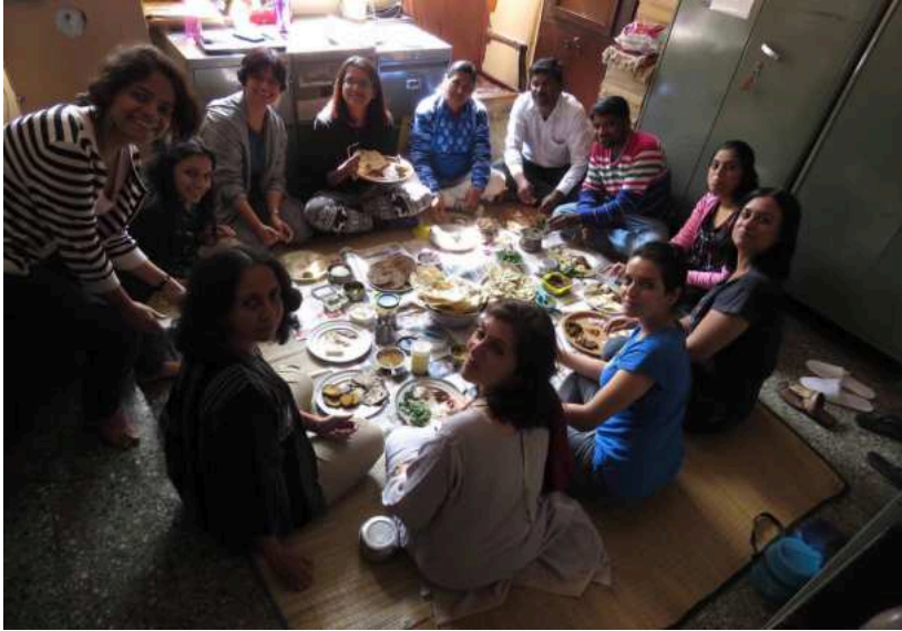
Food has always been an excuse for getting together; a collective meal in Pune, 2019

In the AGBM of 2004, there was also a separate discussion on financial security for members to tide over difficult periods since there is no assured salary, no Provident Fund, no medical or other securities. Associated with this were the questions of whether a small salary is a kind of tokenism and hypocrisy, underestimating requirements, which are then compensated by inequitably distributed socio-economic privilege, or engagement in out-of-KV work which again may be more feasible for some than for others. A sub-group was formed to see how a sense of financial security could be built into the group. Since then, this question has surfaced every once in a while, with attempts at some form of resolution or the other.