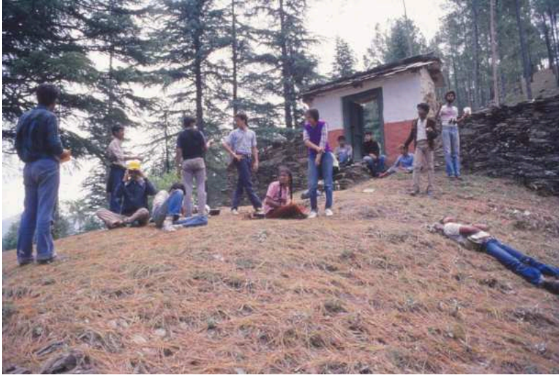
KV padayatris in Tehri Garhwal, 1981