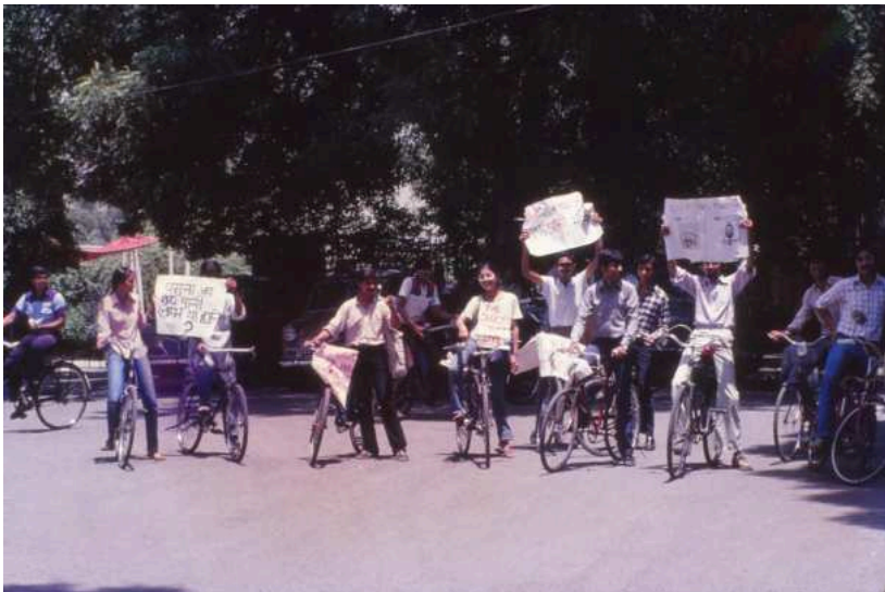
Cycle rally against water and air pollution in Delhi, early 1980s

point, in October 1980, the members resorted to sitting in front of bulldozers that were brought in to raze a wild area in Chanakyapuri, shaming the authorities into admitting its 'Protected' status, and finally getting it fenced off to proper protection. The group protested against the tree-cutting for road-widening for ASIAD (the Asian games) in 1982, commercial constructions near green areas and conversion of wilderness into manicured parks; advocating tree planting using native species where possible.