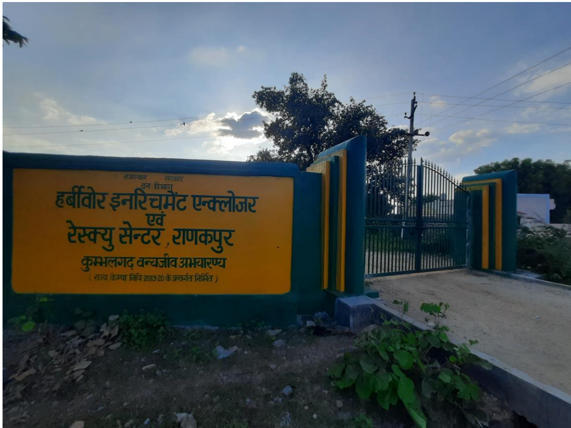
A recently completed Herbivore Enrichment Enclosure and Rescue Centre built near Modia (Ranakpur-Sadri Road)

idea of the tiger reserve due to the revenue it would bring. However, none of these articles carried any reactions from local communities.