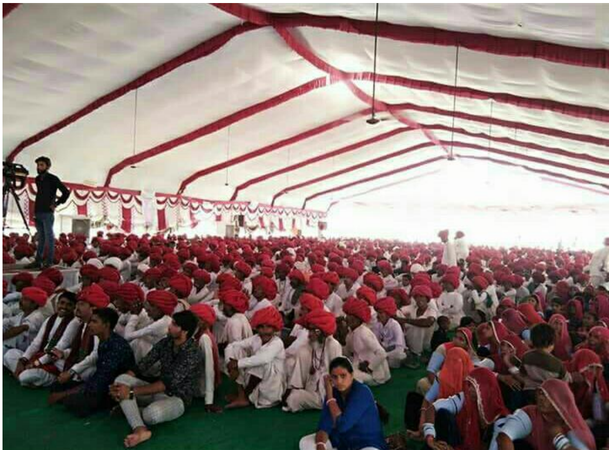
Consultation on issues of Grazing and Access to Forests held in Bali (A town in Pali district of Rajasthan)

As explained above, in the maze created due to various pronouncements on protected areas by the Supreme Court and the processes followed on ground, ambiguity on local processes of rights verification continues; despite the FRA, a legislation passed to give direction to the determination, recognition and vesting of rights process across India.