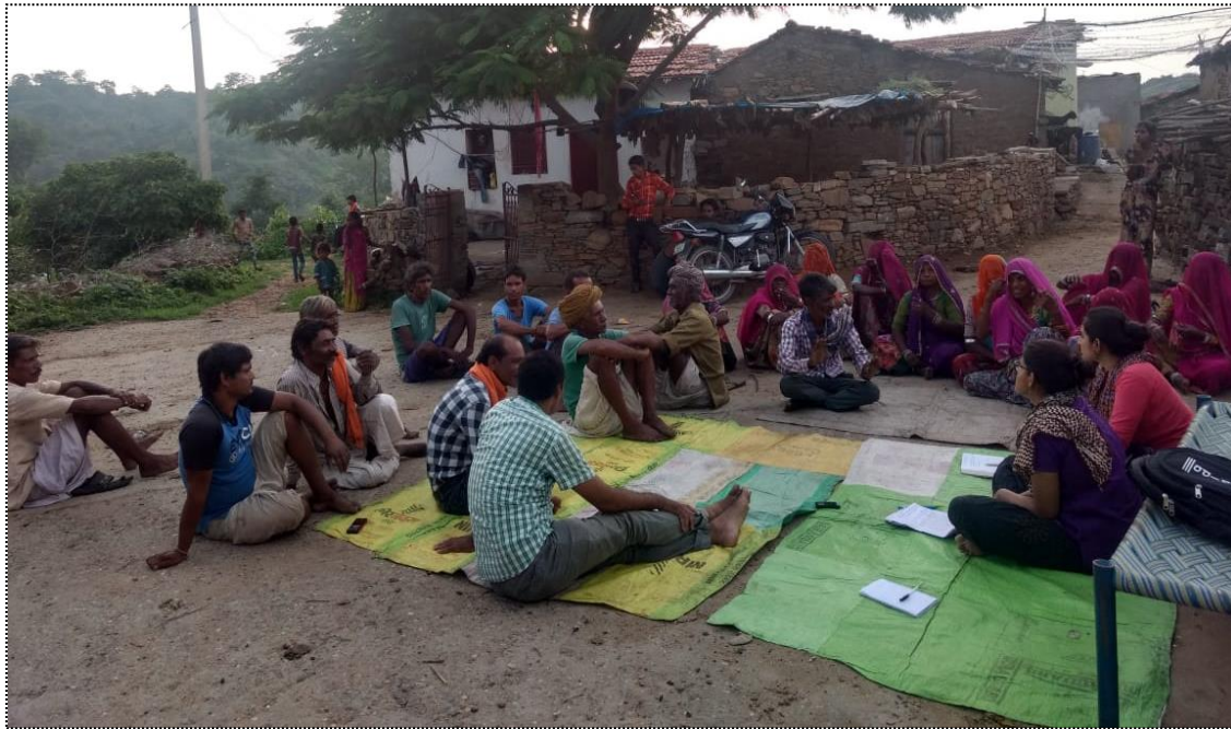
Meeting at Qila Kumbhalgarh Village

The team visited Qila Kumbhalgarh village of Gawar Panchayat, Koyla village of Sevantri Panchayat and Dudhaliya village of Vardara Panchayat (Rajsamand District) and Latada, Sadra and Joba villages (Pali district), Kharni Tokri, Guda Bhop Singh and Garasia Colony (Ghanerao Gram Panchayat) where discussions were held individually and in groups with the village members. In addition, meetings were held with the Sub-Divisional Officers (SDOs) of Bali and Desuri Tehsils and the District Collector (DC) of Pali in July 2019. The team reviewed literature and documentation provided by the office of the DC, Pali and Divisional Conservator of Forest (DCF), Udaipur. In addition, the team has also reviewed studies, academic papers and news reports on the Kumbhalgarh Wildlife Sanctuary.