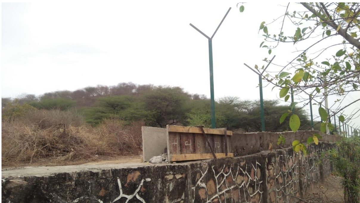
Concretised boundary wall with concertina wires being constructed along the periphery of KWLS

Protected areas are fully under the control of the wildlife wing of the forest department so much so that in processes that must involve the district administration, it relies on information provided by the forest department in all matters pertaining to a protected area. As seen through the examples above, the KWLS is no different.