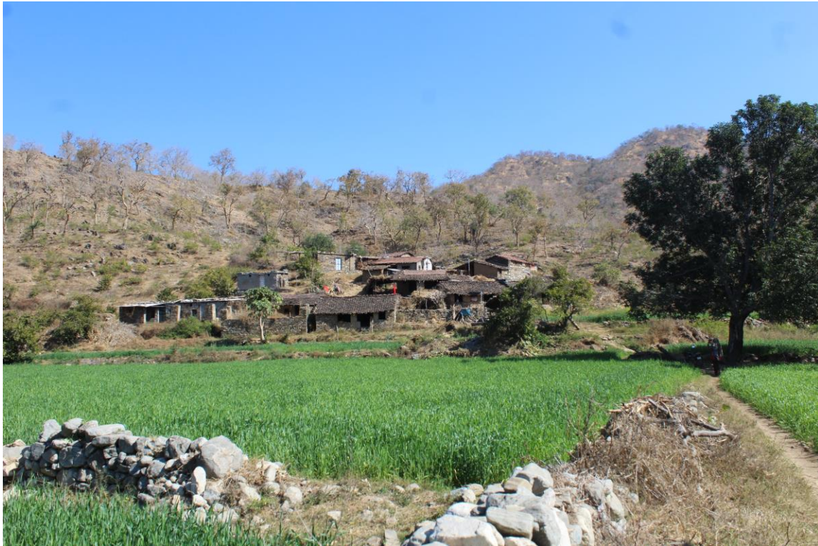
Kharni Tokri Village situated inside KWLS