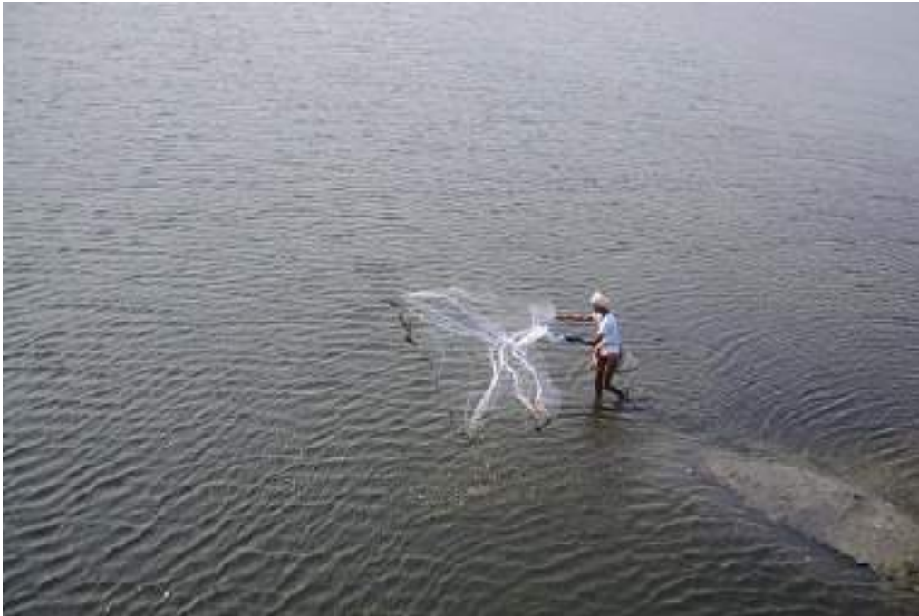
A man casts his fishing net into the Adyar river in Chennai.

the objective is an “additional fish production of 70 lakh tonnes over 5 years”. This is alarming, given indications that India’s seas may already be overfished . In none of the sectors the package deals with, are any guidelines or directives given for assessing what levels of production or use may be sustainable.