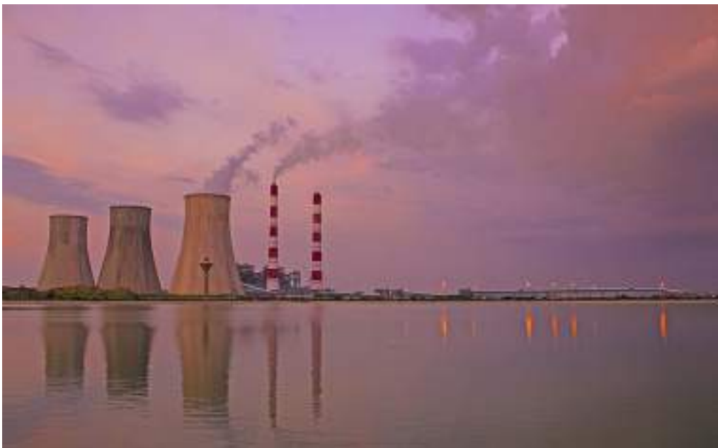
A thermal power plant in Haryana.

Probably the most blatant example of ecological illiteracy in the package, or should one say criminal intent, is that of coal mining. In what can only be termed a cruel joke, this sector is being opened up to a major commercialisation and privatisation boost, and auctions have begun for mining blocks in some of India's most ecologically and culturally sensitive areas. These include parts of central India that the previous government (led by the Congress party) had declared 'no-go', i.e. off-limits to such activities. And this is justified in the name of 'self-reliance', to reduce coal imports.