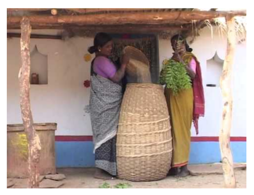
Deccan Development Society, a pioneering initiative led by dalit women is donating food for Covid-19 relief work in south India.

In India, several thousand Dalit women farmers (severely marginalized in India's patriarchal, casteist society, and facing hunger and malnutrition three decades back), organized themselves as sanghas (associations) of the Deccan Development Society in a few dozen villages of Telangana state (http://www.ddsindia.com/). Using their own traditional seeds, organic methods, local knowledge, and cooperation, they have achieved food sovereignty, completely eradicating hunger and malnutrition. They are currently donating about 20,000 kg of food grains for COVID-19 related relief work, and feeding 1000 glasses of millet porridge every day to municipality and health workers and police personnel who have to be on duty despite India's ongoing lockdown.