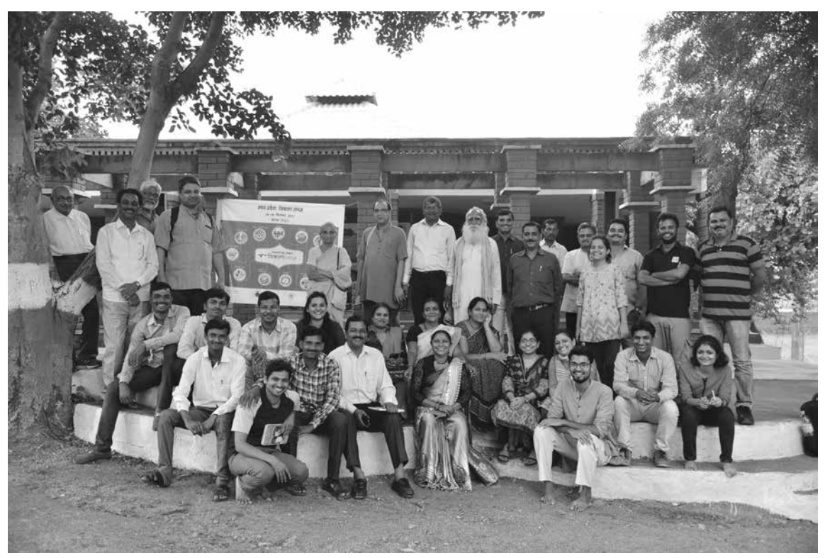
Participants at Madhya Pradesh Vikalp Sangam, September 2017.

Not everyone may agree with all of this, but it is proposed that we can discuss the specifics of the problem elsewhere, while here we move towards what we think the paths and visions forward could be, based on broadly shared sense of the crises. As part of this we also need a greater political understanding of and within local initiatives, and of resistance movements, and through these to create larger solidarity of struggles. And the ability to convey that a search for alternatives is not about everyone retreating into states of scarcity and deprivation, but of having real wealth<sup>3</sup> within the context of sustainability, justice and equity<sup>4</sup>. A society that embodies the ancient notion of swaraj: autonomy and freedom with responsibility, both individual and collective; respect for all life; and self-restraint that comes from the deepening of ethical or spiritual enquiry.