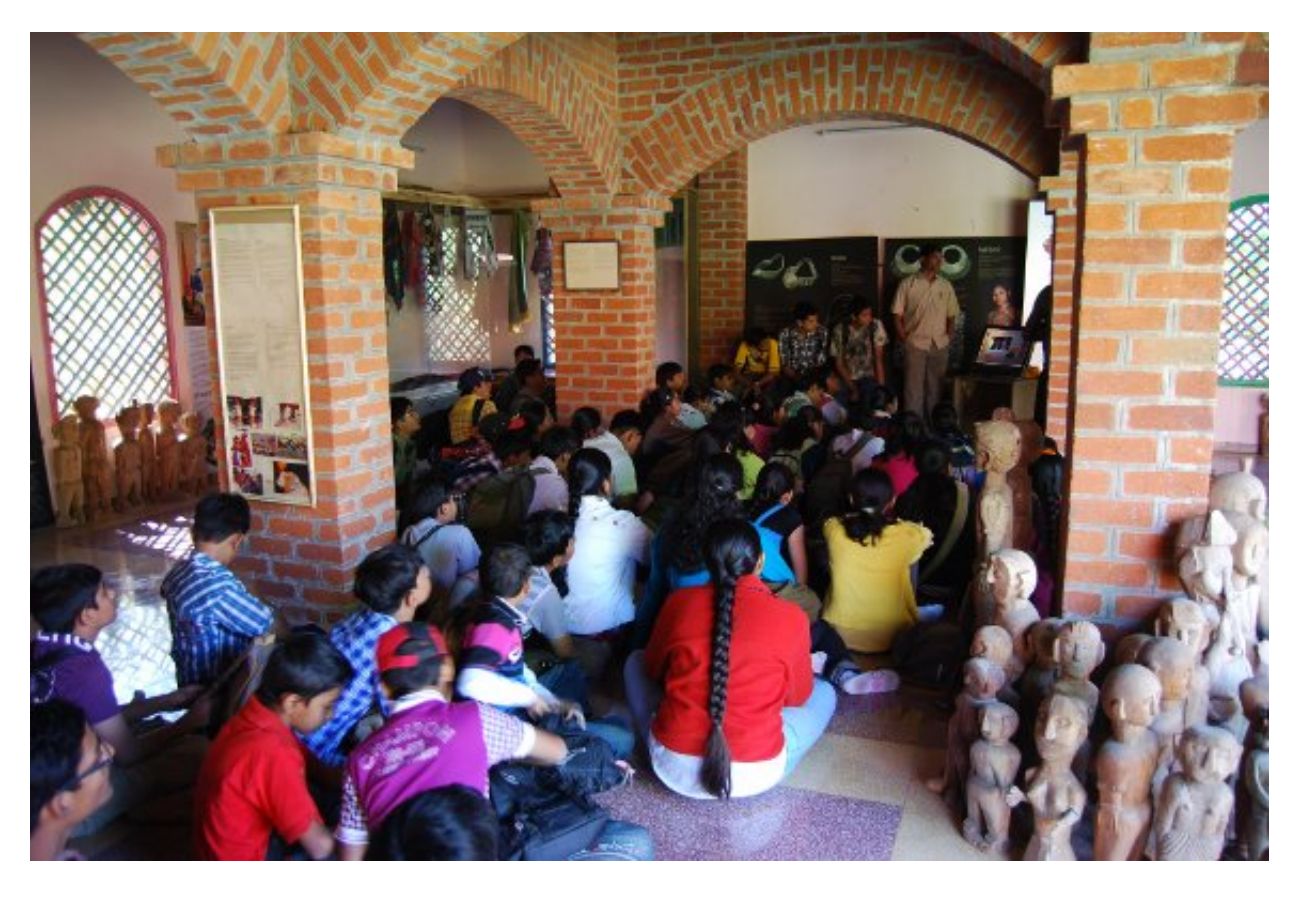
Awareness session with students at Vacha, Adivasi Academy, Vadodara.

Vacha and near to it, Lakhara (an artists' studio), have become the locus of several exciting events including adivasi music and art festivals.