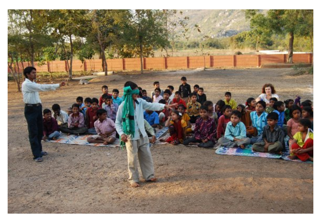
Learning through games at Vasant Shala, Adivasi Academy, Vadodara.

This institution has no standard medium of instruction, the teachers are supposed to learn any mother tongue that a child comes with, teaching and learning happens in multiple languages, and there are no grades with various age groups studying together.