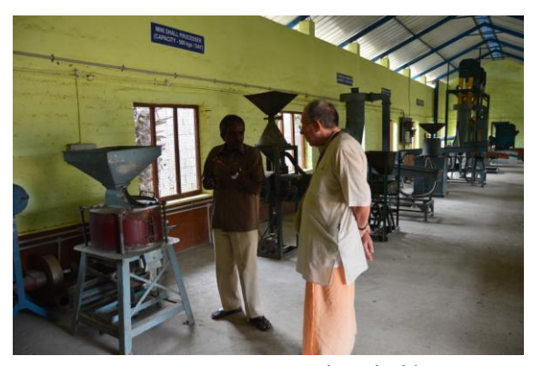
Grain Processing Units, Kuthumbakkam

Also some number of the villagers are employed by external units (Coca-cola) and this may reduce the unity of the village in pursuing an alternative pathway (towards the Network Growth Economy). Hence creating fundamental alternatives in the face of powerful corporate forces seems to be very difficult. There is also a challenge of people's consumerism which took up much of the extra earnings resulting from manufacturing units. It seems the pattern of buying gadgets