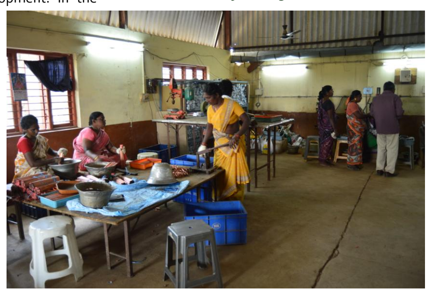
Manufacturing Unit, Kuthumbakkam

The network villages are supposed to share their produce between themselves and supplement each others' production and processing. What will be produced in excess will be sent to outside world - other village clusters or towns for money which in turn can buy products and services not available in the village. A network may contain 15-20 villages and a population of 50,000-60,000.