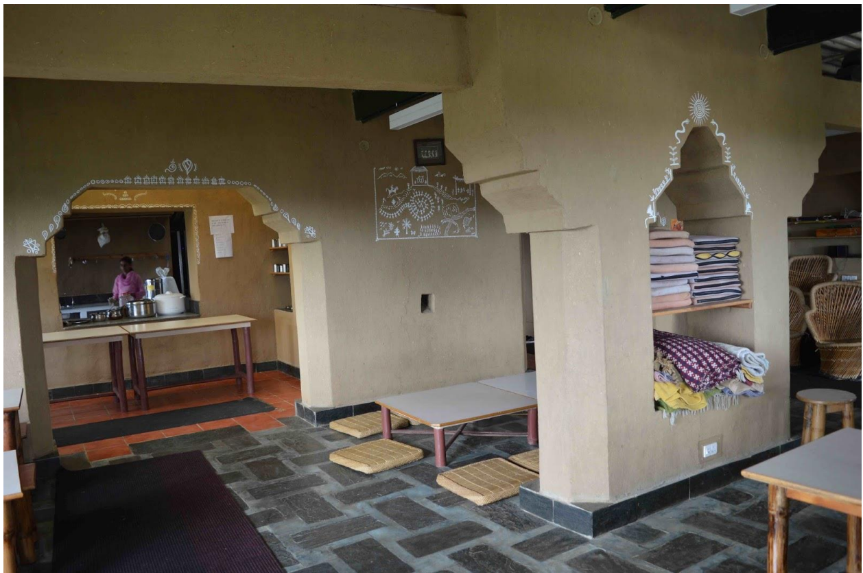
Kitchen and dining hall at Sambhaavnaa