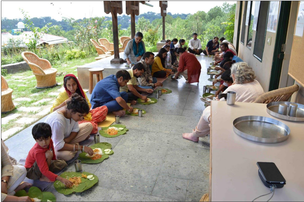
Lunch on Day 3. Traditional Himachali reception known as Dhaam, rice served with delicious traditional curry recipes prepared using local millets and grains from Himachal Pradesh. Samabhaavnaa kitchen team prepared Rajma ka Madra, Khatta; made from chana and aamchuur, delicious sour and spicy and Sepu vadi; gravy of white lentil dumplings.