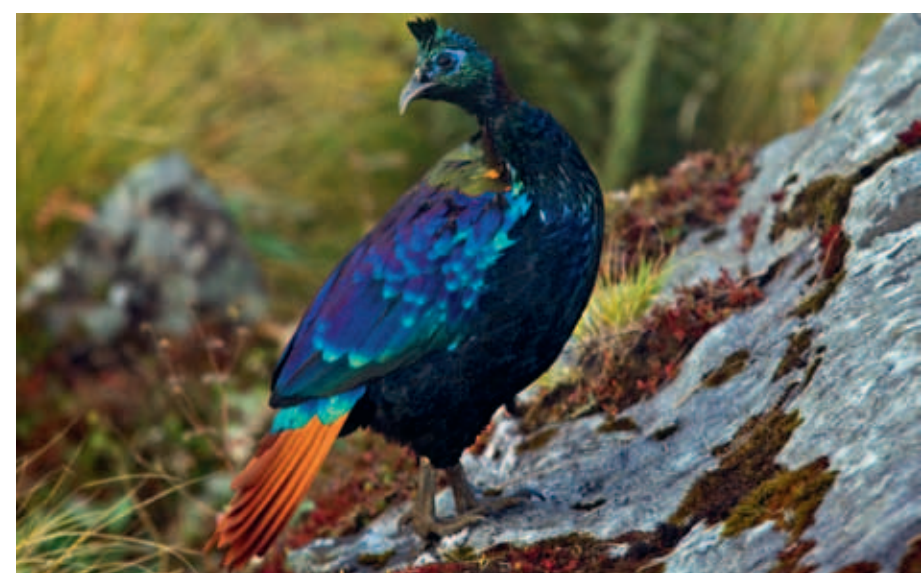
The Yuksom-Goecha La trail follows the icy Rathong Chhu River (top right) through rocky valleys and groves of wild roses; There are over 1,000 species of rhododendron (bottom left) on Earth, and the largest diversity of these pretty plants are found in the Himalayan hills of Uttarakhand, Nepal, and Sikkim; The forests are also home to exotic-looking birds such as the elusive blood pheasant, monal pheasant (bottom right), and the quaint looking slender-billed scimitar (top left).

succumbed to the haphazard development that has inflicted other Himalayan destinations, despite it being the take-off point for the region's trekking routes.