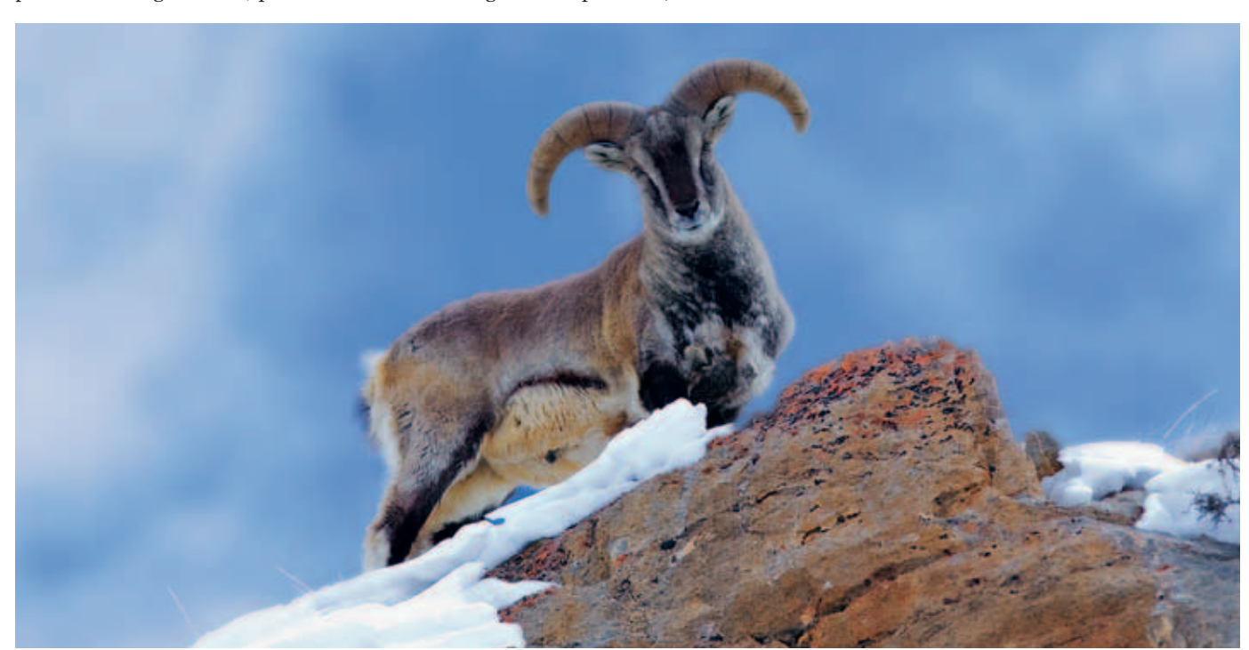
Blue sheep are the favoured prey of snow leopards that haunt the rocky mountains of the national park. They stand very still to blend into their environment when they spot danger, but will run once they realise they have been spotted.

Thanks to the Khangchendzonga Conservation Committee (KCC), locals run homestays, conduct nature tours, create alternatives to wood fuel, and are actively involved in waste reduction. We saw virtually no litter on the trail. Back at our cosy homestay, a warm welcome and hot meal reminded us that travel can be enriching to tourists and the destination. And that sustainable travel initiatives can work to revitalise the environment and preserve local cultures and communities.