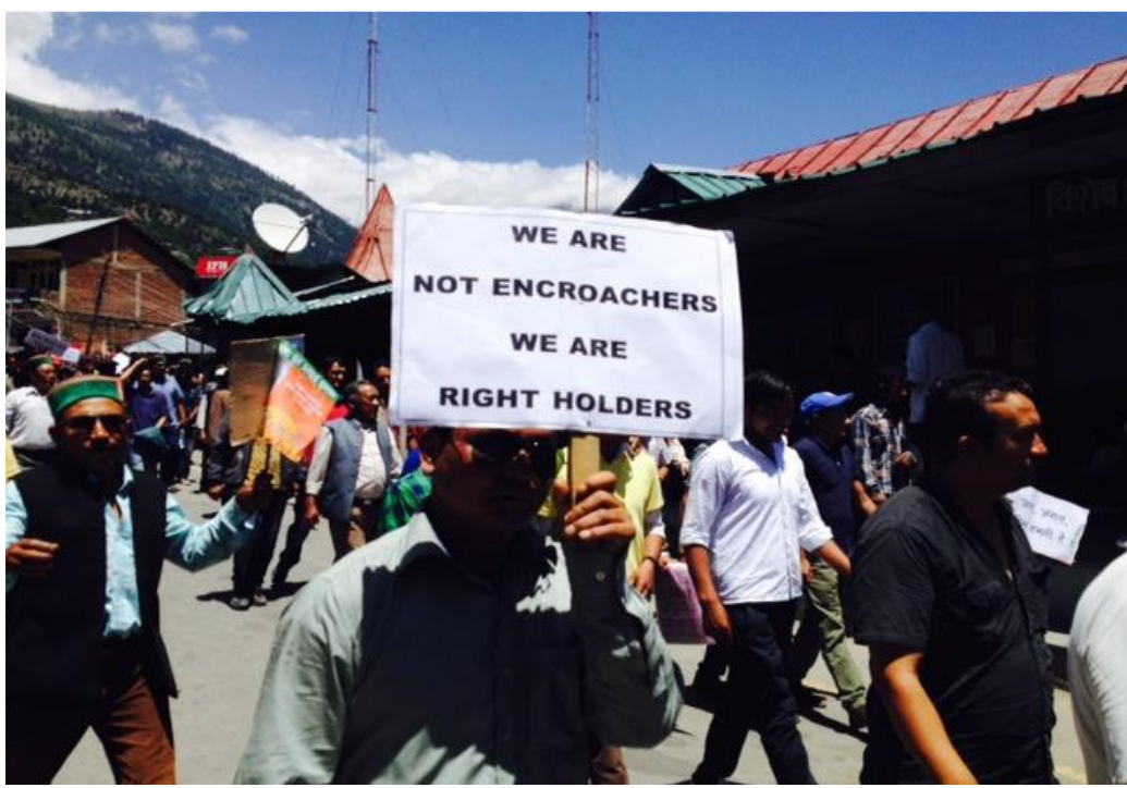
Farmers in a rally organised by Himalaya Niti Abhiyan in Rekongpeo, Himachal Pradesh;