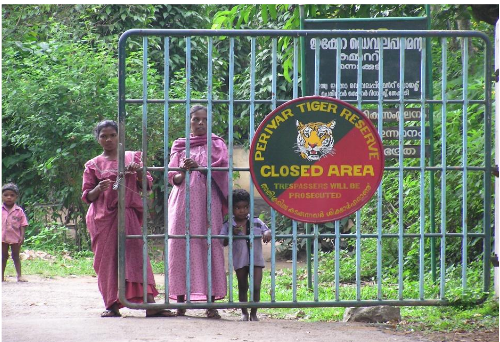
Tribals at the gate of Periyar Tiger Reserve, Kerala;