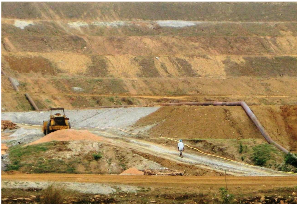
Open Cast mine in Angul, Odisha;

On the 24th February 2015, MoTA has issued a circular stating that for forest clearance in cases involving diversion of forest land for strategic defense project in the north eastern states, a certificate from the District Collector, certifying that, 'no further procedure with regard to the FRA is required', can be given as documentary evidence for FRA compliance; since most forest land in north eastern states is already under the control and ownership of communities and in areas declared as Reserved Forests, and rights have already been settled.