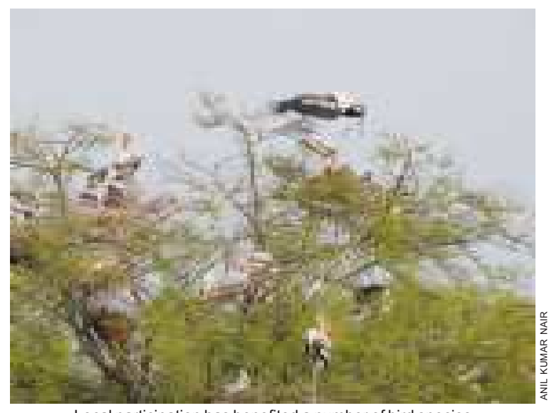
Local participation has benefited a number of bird species like the Painted Stork at Udpuria village

especially the youth, could do with some inputs of modern science to supplement the traditional knowledge their elders can give them. Awareness needs to be raised in adjacent urban areas (e.g. in Bhubaneshwar relating to Mangalajodi), so that town dwellers can appreciate the efforts of communities and extend a supporting hand through sensitive community-based bird tourism. Facilitating activities by NGOs and officials need to be encouraged.