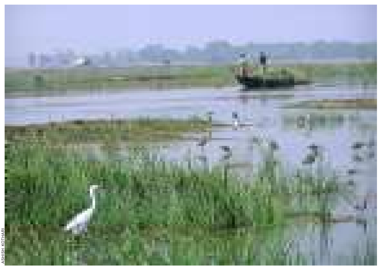
Birds flock to the Mangalajodi wetland, unmindful of villagers carrying about their business

Many bird habitats and populations have recently been converted to Community Conserved Areas (CCAs). Wetlands are more common amongst them. At the edge of Chilka lagoon, an IBA in Orissa, for instance, the village Mangalajodi witnessed a remarkable turn-around in the last decade or so. From a settlement, where nearly everyone hunted birds, to one where