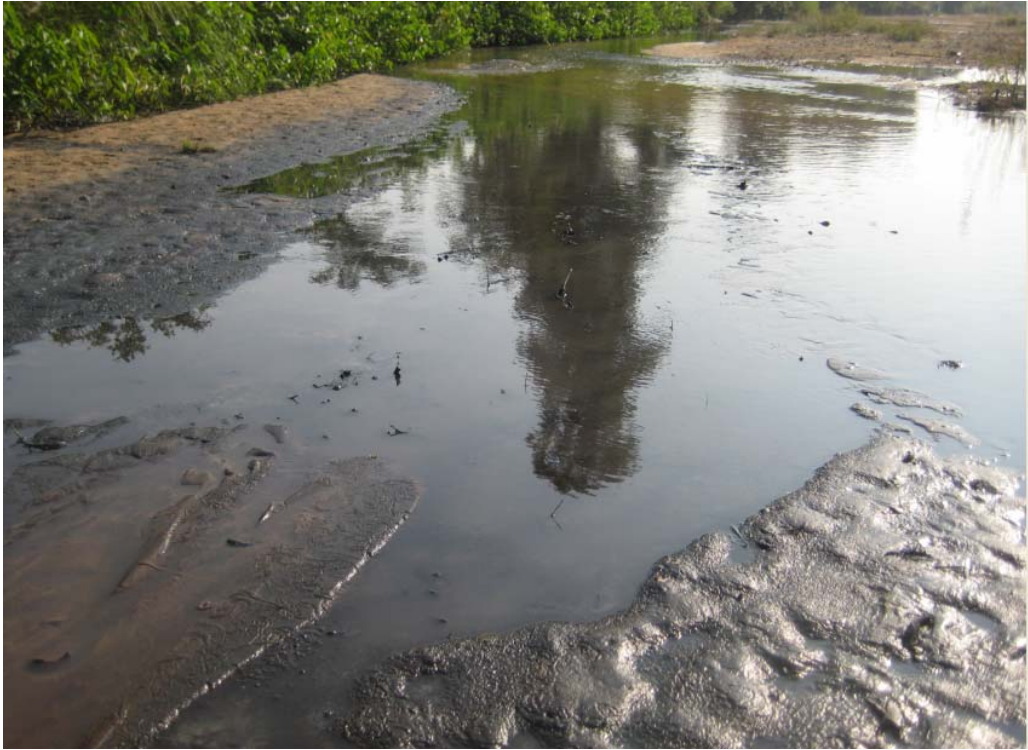
Kelo River' water after interring influent