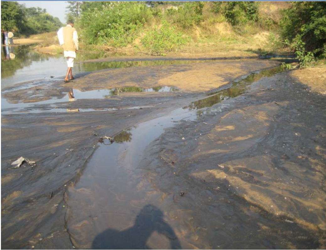
Location : Where Doomar Nala meets with Kelo River, Influent visible with sediments of River