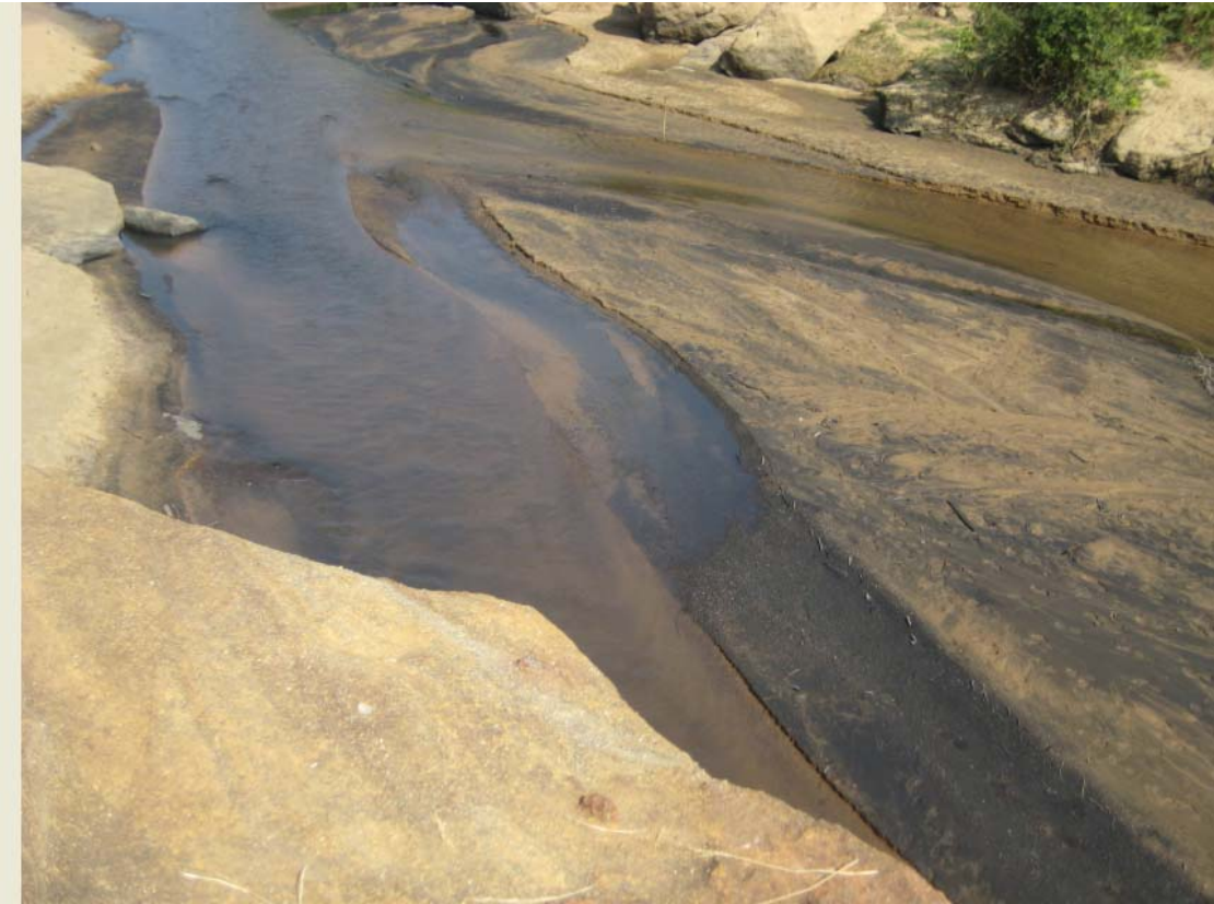
Polluted Kelo River water at Khamaria Village, Which is 3 to 5 km. away from Monnet mines