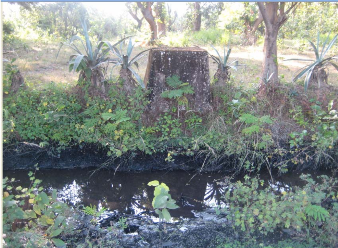
Monnet mines influent in closed proximity of forest land, Forest Moren is clearly visible in photograph.