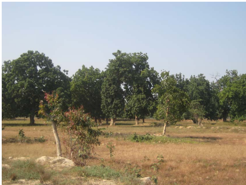
Photograph 2: Sardana Mines at Kharwahi, Raigarh – Surrounding fertile land, which going to be affected by mines.