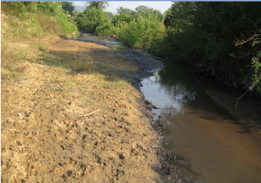
Dommar Nala at Meelu Para Village: Monnet influent interring into Kelo River via this Nala