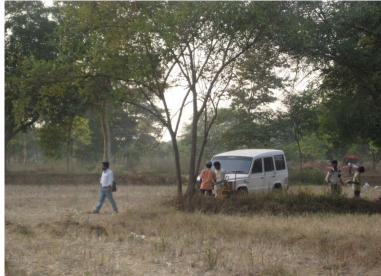
Man and Machine on the work: Despite Refusal to clear by EAC (MoEF)