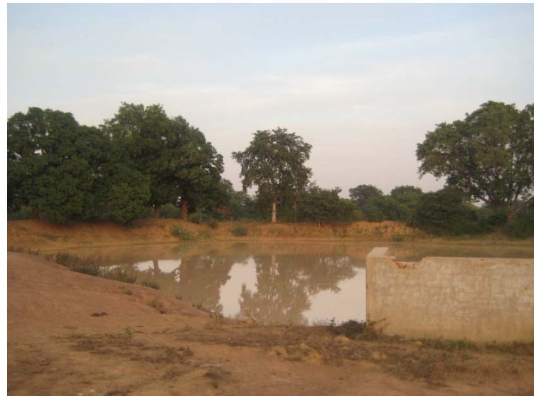
View of the Area: Going to affected by proposed project- MoEF has to decide