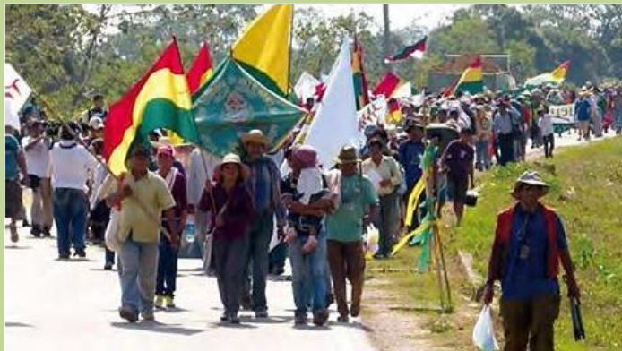
The IX Indigenous peoples' march against the construction of the road through the TIPNIS, in their rise to the Andes (Bolivia).

In 1991, Bolivia ratified ILO Convention 169, and the Constitutional Reform of 1994 recognized the existence of Indigenous peoples and their right to Original Communal Lands (TCOs, in Spanish). Article 2 of the new Constitution (2009) states: “Considering the pre-colonial existence of nations and original Indigenous peasant peoples and their ancestral dominance over their territories, the free determination within the framework of the unity of the State is guaranteed, which consists of their right to autonomy, self-government, their culture, the recognition of their institutions and the consolidation of their territorial entities, in accordance with this Constitution and the Law” . In Article 30, the right to collective title over lands and territories of Indigenous peoples is recognized, which is further elaborated in Article 403. Indigenous peoples exercise a right to property and exclusive access, use and exploitation rights over renewable natural resources on their territories. Regarding non-renewable resources and sub-soil resources like fossil fuels, only a right to prior and informed consult and a share of the benefits of the exploitation is granted.