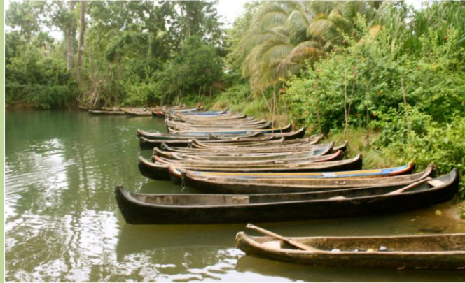
Guna boats, Panama.

The Constitution of the State of Panama ignores the rights of Indigenous peoples to their natural resources. According to the Constitution, the State has national sovereignty over all natural resources in the country. Subsequent laws stipulate that subsoil resources and forests are all property of the State, disregarding Indigenous peoples' rights to the same resources. This has triggered many conflicts and cases of loss of natural resources due to both legal and illegal exploitation.