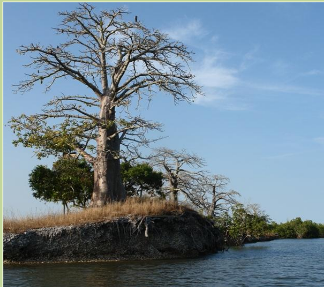
A centuries-old shell mound at Petit Kassa , Casamance, Senegal.

Senegal , like many countries in sub-Saharan Africa, has numerous small sacred forests and other sacred natural sites. However, they are not given any formal status under protected area legislation or other statutes and their protection is entirely dependent on local norms and customs.