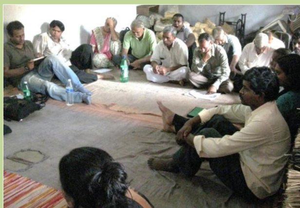
Members of the federation of community conserved areas in Nayagarh district, Orissa (India), meeting to discuss the 2006 Forest Rights Act.

In India , for instance, the Forest Rights Act has seen very inadequate use by communities to claim rights to and governance of forests. There are several reasons for this, including lack of awareness about the Act or how to make claims; lack of proactive assistance from government departments; deliberate obstruction by some government agencies or officials; difficulties in finding evidence to file with the claims; and superimposition of top-down boundaries related to government schemes rather than acceptance of customary boundaries of the community.