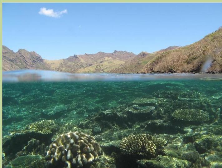
A ridge-to-reef seascape from Waya Island, Fiji.

In terms of current legislation, the Fijian i Taukei Lands Act provides in Section 3 that 'native lands shall be held by native Fijians according to native custom as evidenced by usage and tradition.' This provision allows for a broad spectrum of usage and governance rights defined