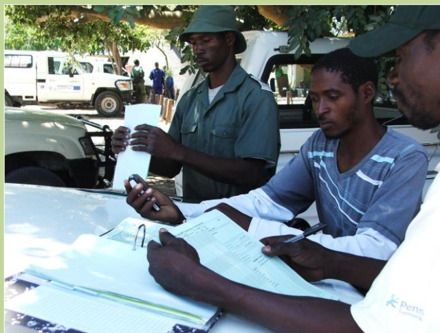
Community game guards download GPS data during the annual game count in the Mayuni Conservancy, North Eastern Namibia.

Article 96 of Panama's Wildlife Law (1998) states that the National Environmental Authority will coordinate all matters related to the environmental and natural resources in Indigenous peoples' territories with the traditional authorities of the relevant peoples and communities. The law also stipulates in Article 104 that when authorizing the use of natural resources in Comarcas or the lands of Indigenous peoples, projects presented by the members of the community will be preferred, provided they meet the conditions and procedures established by the competent authorities.