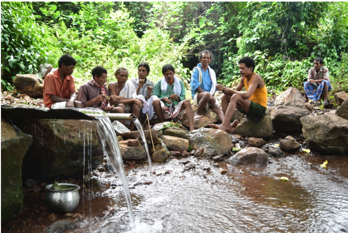
A pre-wedding ritual being performed

Konds have a complex system of marriage, where bride price plays an important economic and cultural role. It could range from a variety of practices including actual exchanges of valuable commodities from the groom's family to the bride's family, and also service that a prospective groom would provide in the form of working the bride's fields 52 . As money has slowly begun to replace many valuable commodities many Dongria Kondh youth especially men, feel that their families are incurring large debts for paying the bride price. In a wedding ritual we attended, we also saw the reverse practice of the bride's family supplying the girl with dowry. Some members of the NSS are of the opinion that the practice of give and take must stop and marriages should be arranged to stop any practices of bride price or dowry, to prevent the cycle of debt.