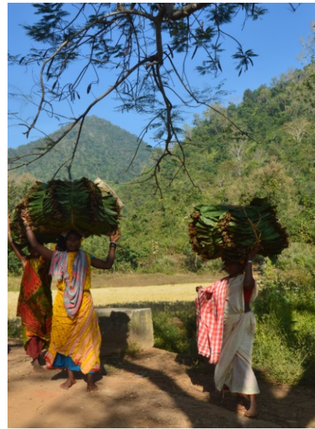
Women carrying bundles of Siali (Bauhinia vahili) leaves to sell in the market

Losing Niyamgiri has been likened by many Dongria Kondh to losing their identity . The Dongria Kondh culture and identity is intricately linked to them being Niyamraja's kith and kin. The name Dongria is an Odiya term for people of the hills . But, the Dongria identify themselves as Jharnia , the protectors of the many streams of Niyamgiri. This deep belief of being guardians is manifested through their unique forest management techniques employed in the agricultural practice. The trees at the top of the hills are never cut, since they consider these to be the abode of the pantheon of gods and goddesses, and these are also the origins of streams and protect the loss of soil and water during the monsoon.