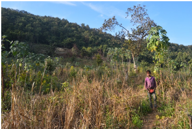
Boy guarding the podu field

pointed out that the religious and cultural rights of the Dongria Kondh as recognized under the FRA, were not put before the community over the land to be mined for bauxite, for their 'active consideration'. Thus, it ordered the state of Odisha to place these issues before the Dongria Kondh 43 . In July and August 2013, gram sabhas were organized in 12 villages of Rayagada and Kalahandi districts by the state, and all the 12 villages rejected the mining proposal. Prior to the palli sabhas , in 2013, the Odisha state government illegally 44 prepared a report of the community claims over minor forest produce, grazing land, podu fields etc. The reports were placed before the villagers during the palli sabhas ordered by the SC. The villages however, rejected the community claims and individual claims over minor forest produce, grazing land and podu fields that were placed before them. This was because the claims over land and resources put forward by the officials were divided, classified and measured into measured categories like grazing land, sacred spots, streams. 45