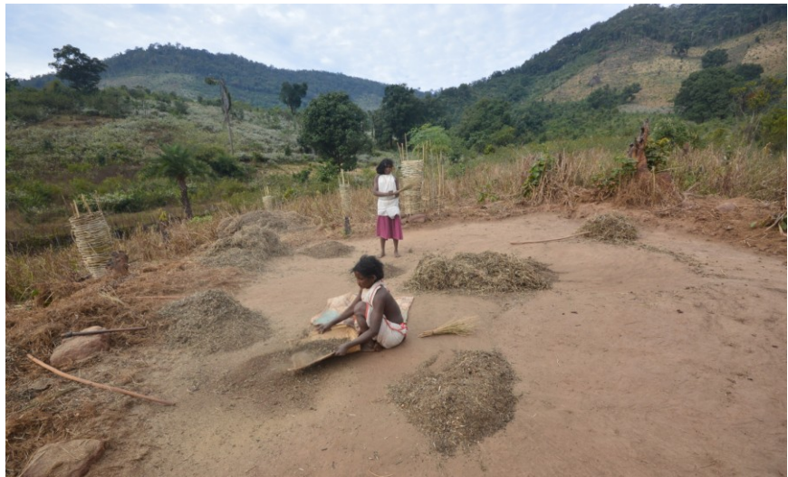
Harvest time in fields

have a soul, which is to be revered. Thus, the polytheist, animist belief is guided by the proximity to the moods and rhythms of nature, commanding respect for and co-operation with natural forces. This is reflected in the way of life practiced by the community and in their socio-cultural relationships. The Niyamgiri hills, abode of Niyamraja are thus entirely sacred, and the daily practices of life, habitation and subsistence are thus deeply integral to the sacred life-giving capacity of Niyamgiri.