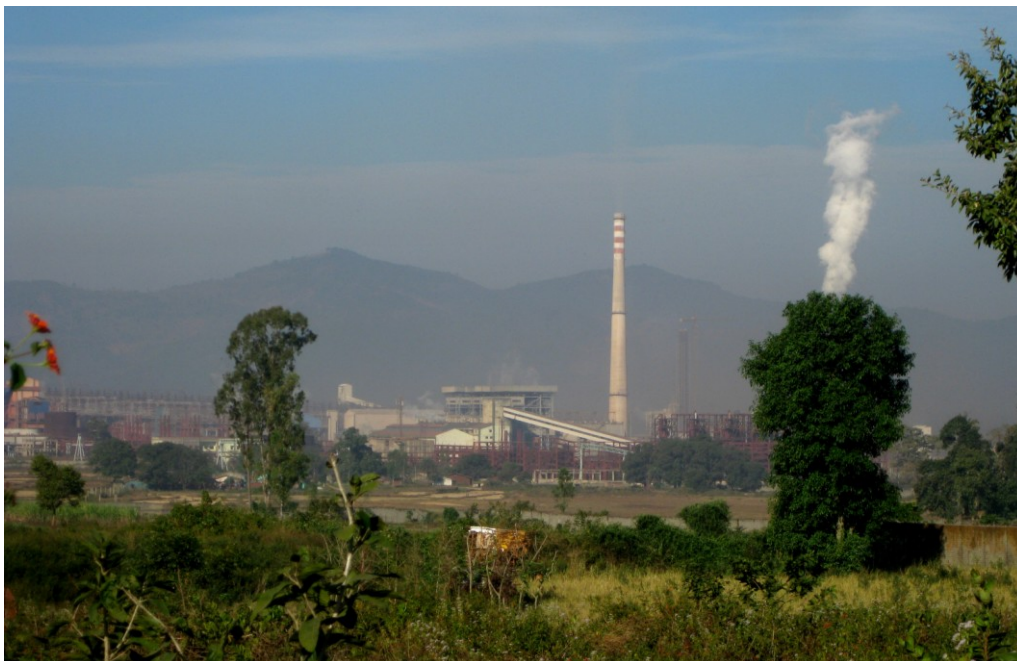
Vedanta Alumina Limited's Bauxite Refinery at Lanjigarh

aluminum refinery in Lanjigarh block of Kalahandi district and opening up of the Niyamgiri hills for mining to supply bauxite to the refinery 36 . By June 2002, the first phase of land acquisition for the refinery had already started and by mid 2006, the refinery had started functioning. The opposition to the factory also began almost immediately. Despite this, the refinery was built illegally, circumventing various environmental laws as well as laws for the protection of these communities 37 . At the same time, many activists continued the struggle by filing writ petitions in the High court and Supreme Court against the project, which played a role in deferring the forest clearance required for the mine 38 .