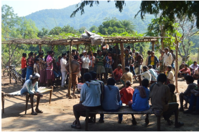
An anti-liquor meeting underway in Gorota village

Today, the Niyamgiri Suraksha Samiti continues to struggle against the attempts by the state government and the company. While the NSS was formed for the purpose of opposing the project and to assert local rights over the Niyamgiri forests, water and land, the focus is slowly expanding to addressing issues facing the land, culture, livelihoods and way of life of the Dongria Kondh.