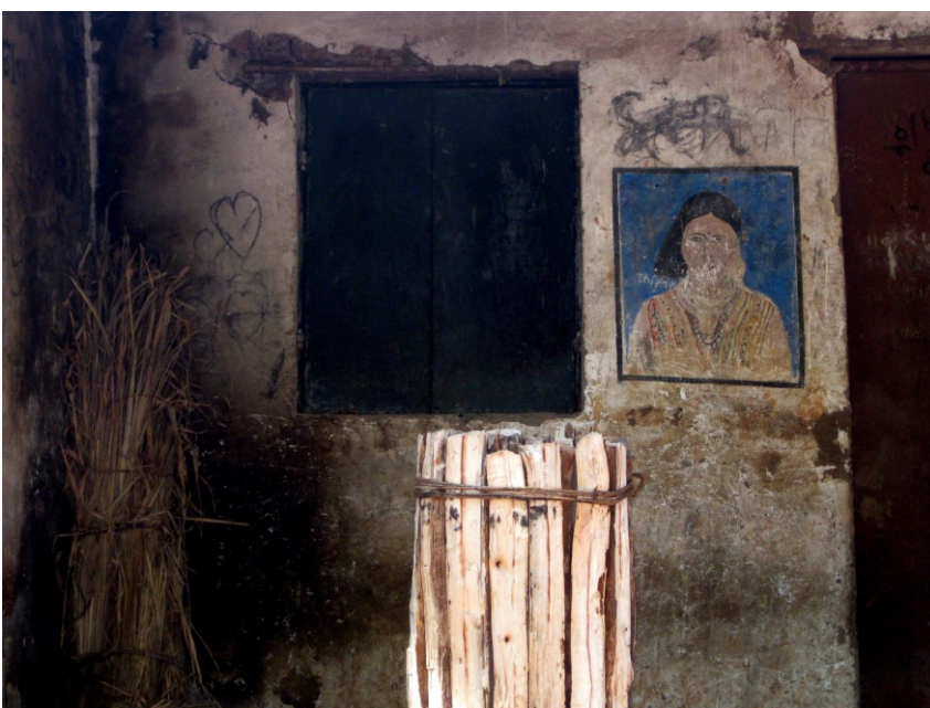
School in Gotota village being uses as a storage shed

The Dongria Kondh women, youth and elders are vocal about the need for education. However, while at Niyamgiri, we observed school rooms in Gorota and Dhamanponga villages that were built by the DKDA nearly 25 years ago but which are not in use anymore. In Dhamanponga, the community revealed that the school was operational till about 2 years ago, but was shut down when the school teacher, a non-Dongria, left. This refutes the charge made by the District Collector that 28 schools are operational inside the Niyamgiri hills. The Dongria Kondh believe that many of these schools remain non-functional due to the lack of dedicated teachers who are unwilling to stay in 'remote' locations inside forests.