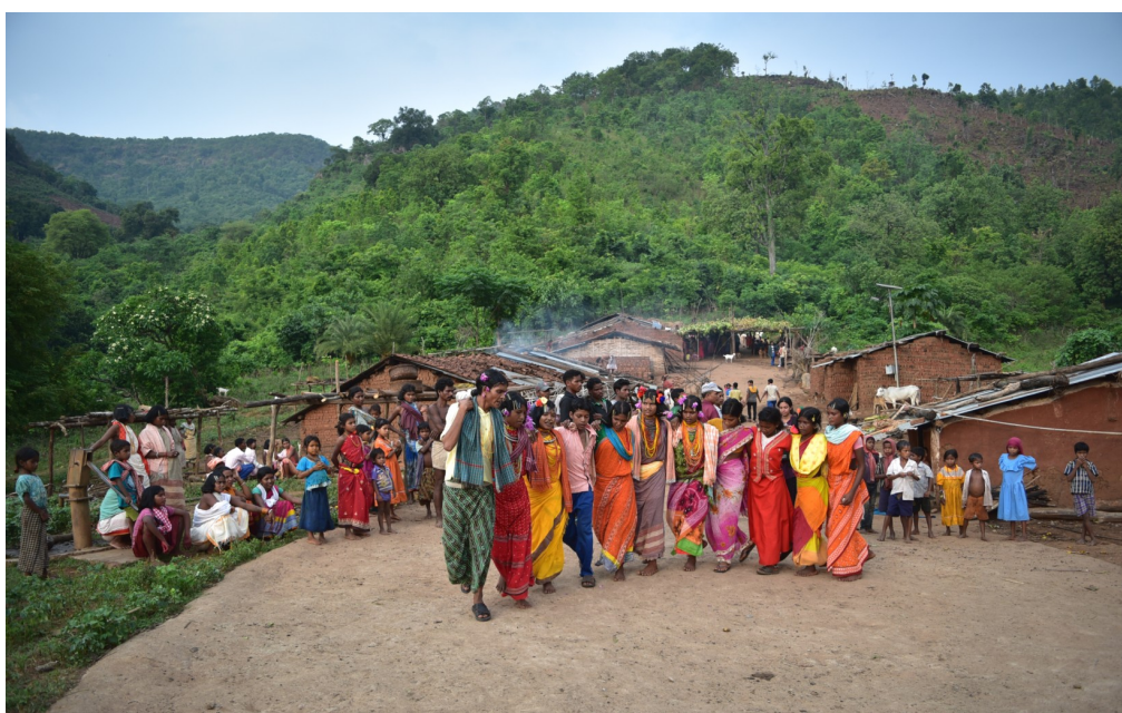
Young boys and girls dancing at a wedding feast

The Dongria Kondh are aware that to a large extent, money has become a necessary factor to live in the Niyamgiri hills and interact with the outside world. The Dongria Kondh explained that their need for money some