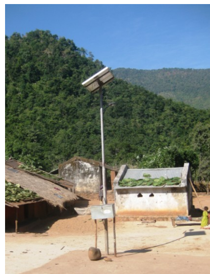
Solar lamp at Serkapadi village

Most Dongria Kondh the team met were critical of the role of the DKDA. In most of the villages, the schemes carried out by the DKDA are not done in consultation with the village. The DKDA distributes solar lamps, builds concrete roads in some villages,