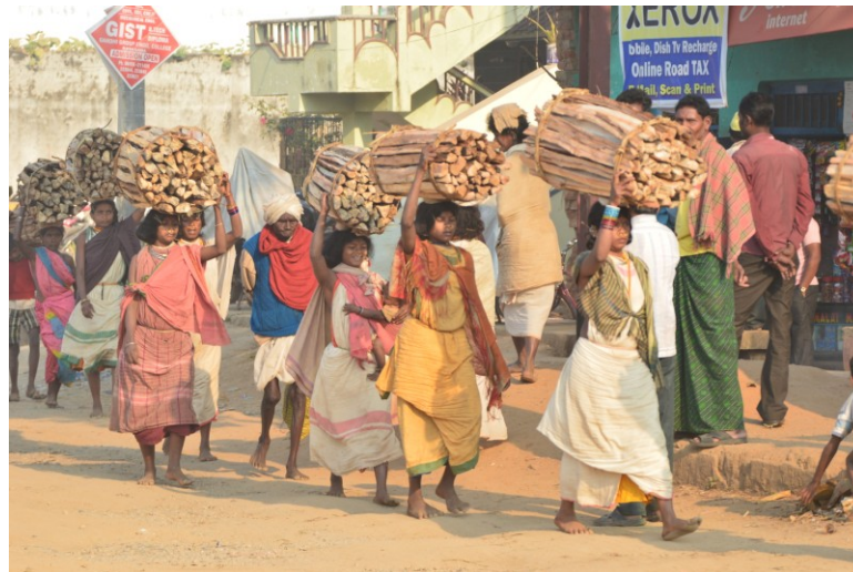
Dongria Kondh women carrying wood to sell in Muniguda

Easy access to certain 'goods' and 'services' through government schemes has begun to change their way of life. Rationed goods, especially rice through the Public Distribution System has changed their food consumption pattern, away from millet production and consumption, which they have been self-sufficient in.