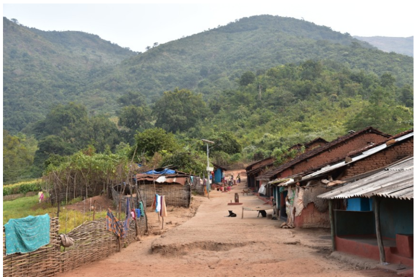
The Domb settlement of Sanodenguni village

These articulations need to be considered by both the communities for a sustainable future in the hills.