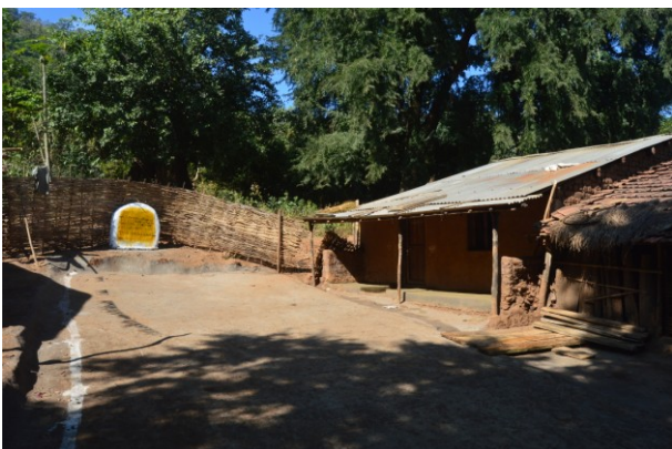
Plaque announcing concrete road constructed by the DKDA

However, the Dongria Kondh revealed, and our preliminary observations indicated that the conceptualization and implementation of these schemes and developmental plans have been at odds with the way of life of the community. The community revealed that all these works are coordinated by the gram panchayat . As already stated, one gram panchayat consists of several Dongria Kondh villages and other villages from the plains.