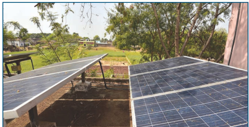
Solar power micro-grid at Dharnai, Bihar, provides reliable electricity and is managed locally

This includes initiatives that encourage alternatives to the current centralized, environmentally damaging and unsustainable sources of energy, as also equitable access to the power grid, including decentralized, community-run renewable sources and micro-grids, equitable access to energy, promoting non-electric energy options such as passive heating and cooling, reducing wastage in transmission and use, putting caps on demand, and advocating energy-saving and efficient materials.