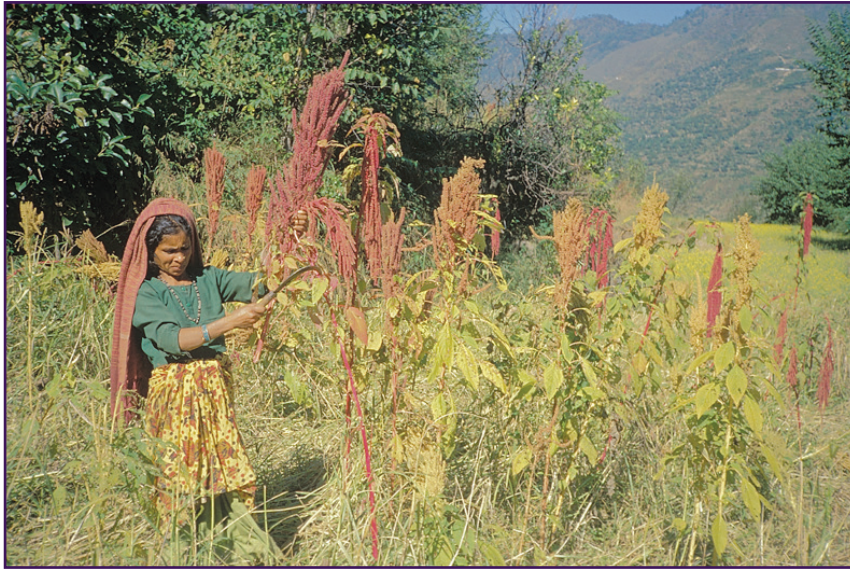
Traditional crop diversity conserved by Beej Bachao Andolan, Uttarakhand