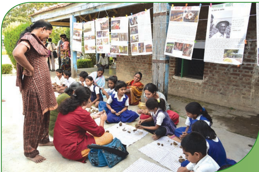
Anand Niketan students demonstrating clay work at Maharashtra Vikalp Sangam, Wardha, October 2015