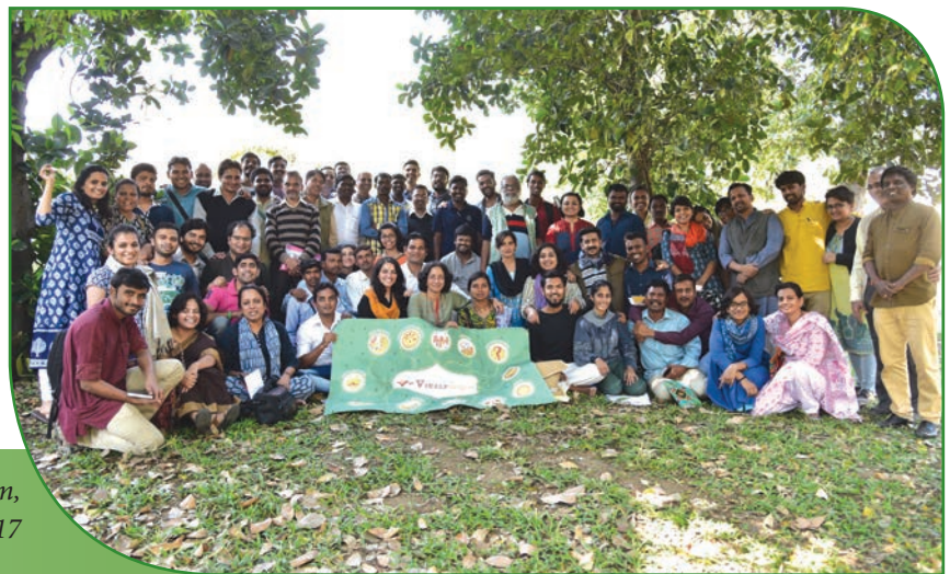
Participants of Youth Vikalp Sangam, Bhopal, February 2017