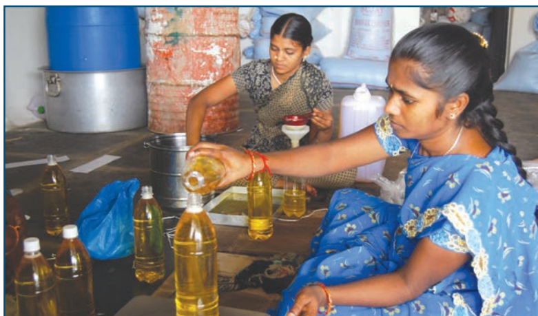
Organic farming based products by Dharani Producer Company at Timbaktu Collective, Andhra Pradesh

Here too, the Framework cautions against would-be alternatives: "What may not constitute alternatives are superficial and false solutions, such as predominantly market and technological fixes for problems that are deeply social and political, or more generally, 'green growth'/'green capitalism' kind of approaches that only tinker around with the existing system."