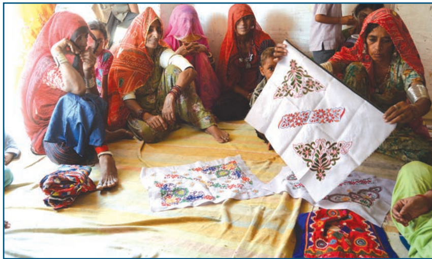
URMUL's work with women craftspersons near Bikaner, Rajasthan, has helped generate self-confidence and livelihoods