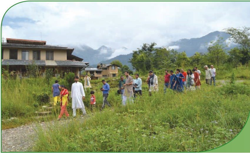
Participants of Western Himalaya mini-Vikalp Sangam at Sambhaavnaa, Himachal Pradesh, August 2016