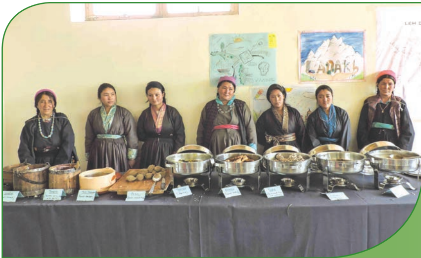
Ledo Village women's group with traditional recipes using local biodiversity, at Ladakh Vikalp Sangam, July 2015