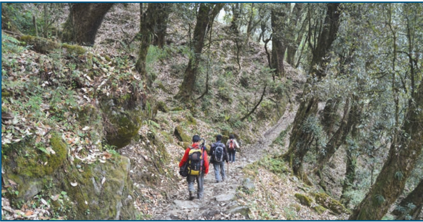
Zero-waste trekking trail at Khangchendzonga National Park, Sikkim

efforts of the local communities gain immense significance ( http://www.kalpavriksh.org/index.php/conservation-livelihoods1/community-conserved-areas ). Even in urban areas, there have been attempts to revive ecosystems in Bengaluru ( http://vikalpsangam.org/static/media/uploads/Resources/kaikondrahalli_lake_casestudy_harini.pdf ), Udaipur, and Salem. Jheel Sanrakshan Samiti, a people's organisation formed by concerned citizens of Udaipur in regard to water management and pollution crises has worked tirelessly to ensure lake rejuvenation and combat water issues in the city ( http://vikalpsangam.org/article/anil-mehta-a-man-with-a-mission/#.ViYCL37hDIU ; http://www.vikalpsangam.org/article/life-of-pi-yush-21st-century-activist-salem/#.V6wEuWVvKTS0 ). There have been efforts at making tourism more ecologically sensitive as well. Kanchendzonga Conservation Committee (KCC), an organisation that was set up by the local youth of Yuksom village, west Sikkim in 1997, works to balance resource and conservation to make the mountain and tourism development sustainable. The committee promotes village home stays, zero waste trekking, and has formed Ecotourism Service Providers Association of Yuksom (ESPAY) (see http://www.vikalpsangam.org/article/conserving-sacred-spaces-kanchendzonga-conservation-committee-sikkim/ ). There have also been many initiatives at creating localised curricula and extra-