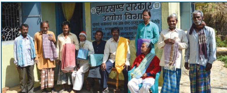
Jharcraft has enhanced traditional skill-based livelihoods and reduced outmigration from Jharkhand's villages

The Framework points out that elitist, costly models that appear to be ecologically sustainable but are not relevant for or affordable by most people, may not fit into alternatives.