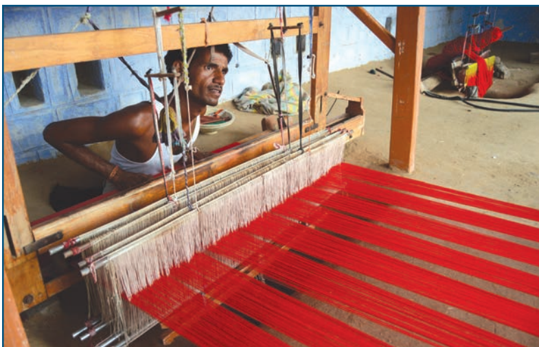
Revival of loom weaving in Kachchh sustains traditional skills and provides decent livelihoods, enabled by Khamir

Examples of such livelihoods include: the revival of sustainable, organic agriculture by dalit women members of the Deccan Development Society in Telangana who are practicing highly bio-diverse farming methods, treasuring traditional seeds, and initiating the Africa-