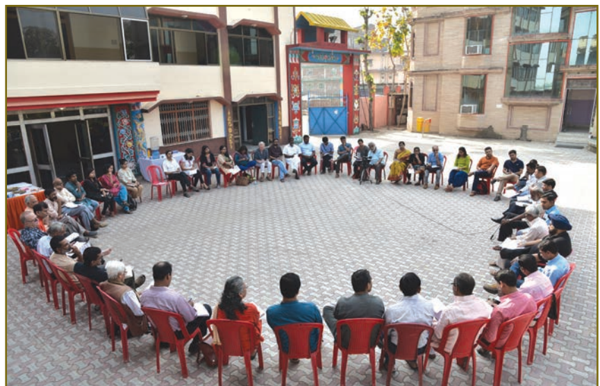
Energy Vikalp Sangam, Bodh Gaya, with groups & individuals working on energy policy, grassroots practice, and advocacy, March 2016