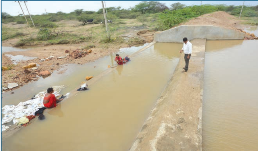
Decentralised, locally managed water harvesting and socially regulated use in India's driest region, Kachchh

of communities in arid and semi-arid areas by resolving ecological constraints through facilitation and access to technologies or institutional solutions. The focus is on groundwater management and urban watershed management ( http://www.kalpavriksh.org/images/alternatives/CaseStudies/KachchhAlternativesReport.pdf and http://act-india.org ). Many more examples are available on India Water Portal ( http://www.indiawaterportal.org/ )