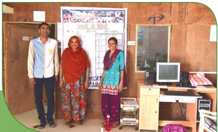
Staff of Saiyaren Community Radio, Kachchh, servicing 25 villages with features, music, discussions, and much else