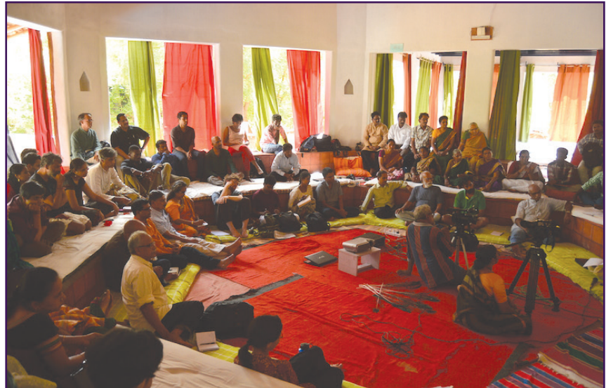
Andhra Pradesh and Telangana Vikalp Sangam at Timbaktu, October 2014