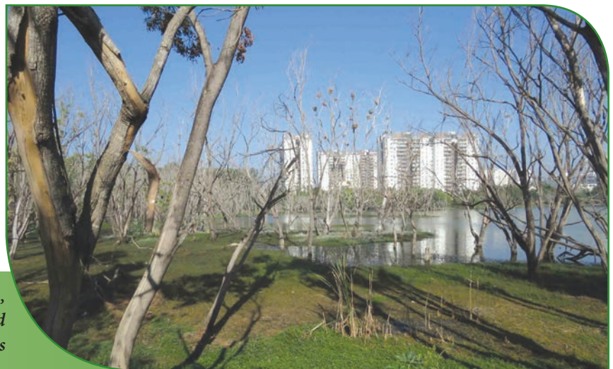
Kaikondrahalli lake, Bengaluru, revived as public space and wildlife refuge by local residents