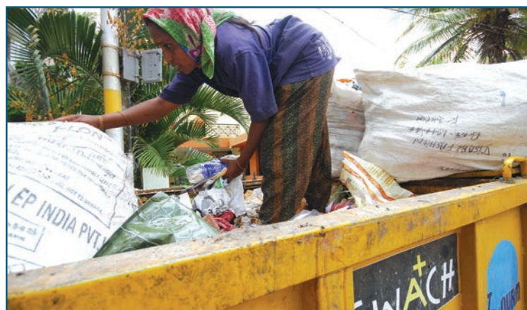
KKPKP & SWaCH have enabled women wastepickers in Pune to achieve greater dignity, better earnings, and social empowerment

This includes the search to make human settlements (rural, urban, rural) sustainable, equitable, and fulfilling places to live and work in, through sustainable architecture and accessible housing, localized generation of means of satisfying basic needs as far as possible, ecological regeneration, minimisation of waste and its full upcycling or