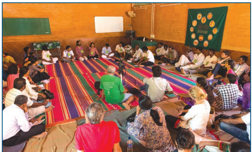
Participants at Tamil Nadu Vikalp Sangam, February 2015.