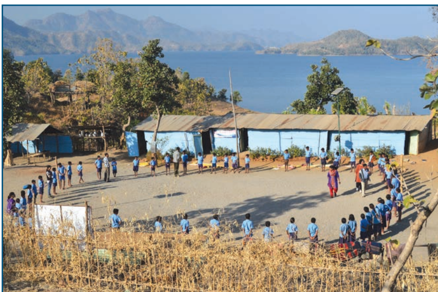
Jeevan Shala at Manibeli (Maharashtra), one of several alternative schools set up by Narmada Bachao Andolan as part of its struggle

Examples of such initiatives are growing in India. For example, Swasthya Swara based in Chhattisgarh aims to address rural community's health issues by reviving the traditional herbal/medicinal knowledge of Vaidas and Ayurvedic doctors ( http://www.vikalpsangam.org/article/swasthya-swara-a-unique-community-health-solution/#.V6tiv2VkTSo ). Similarly, Tribal Health Initiative based in Tamil Nadu works to provide decent health care services to tribal communities living in the Sittilingi valley by initiating a variety of community health care programmes. ( http://www.tribalhealth.org ).