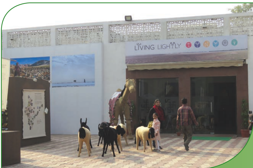
Living Lightly, a mobile exhibition on pastoralism across India, devised by communities and civil society groups, as a tool for transformation and public awareness