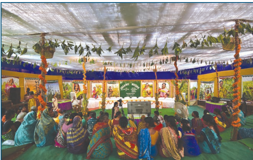
Organic Medak event by Deccan Development Society in Telangana: enabling dalit women to gain socio-economic dignity and decision-making power

There are thousands of examples of community conserved areas (CCAs) across India. CCAs are areas where humans and wildlife co-exist. In these times when biological diversity is under grave threat, conservation