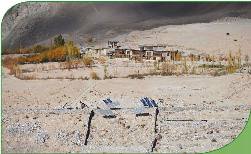
SECMOL alternative learning centre, Ladakh, powered by passive and active solar energy