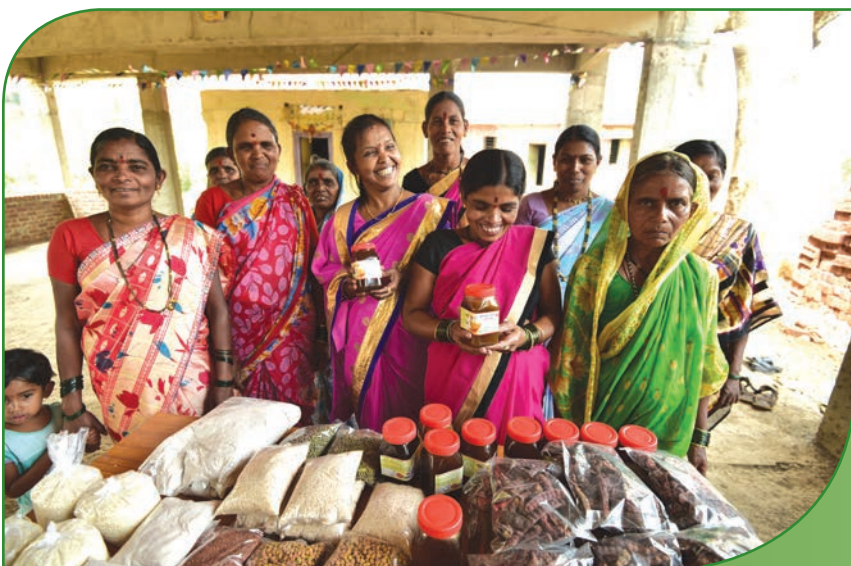
Members of women's self-help group in Bhimashankar (Maharashtra), displaying products in honey festival organised by Kalpavriksh & others, April 2017