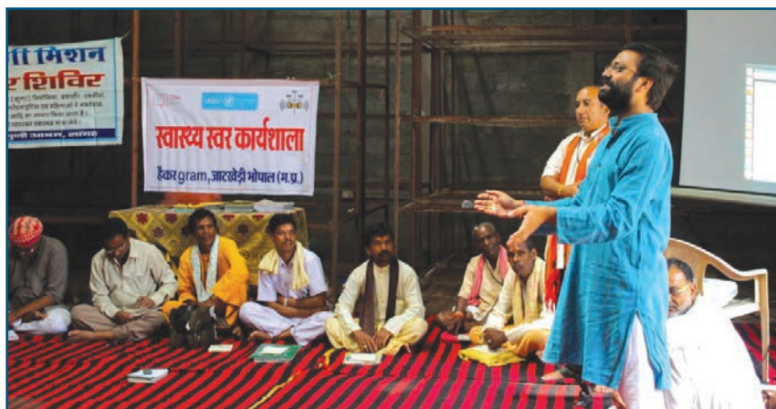
Swasthya Swara connects health workers to people in Chhattisgarh through innovative use of communications technology

around Balenga Para in the Bastar region of Chhattisgarh, which fosters independent learning environment where children decide what they wish to learn at school ( http://www.vikalpsangam.org/static/media/uploads/Resources/imlee_mahuaa_learning2.pdf ); and Karigarshala of Hunnarshala foundation based in Kachchh, Gujarat, started with an objective to capacitate people for reconstruction of their habitat by