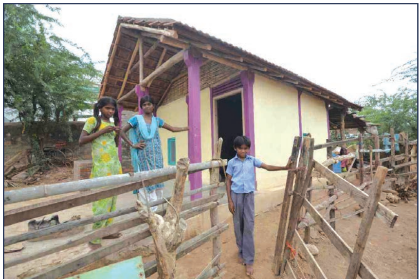
Decent housing, easy to construct, for low-income families in Bhuj, Kachchh

Of course, the framework recognises that actual initiatives towards alternatives may not fulfil all of the above. As a thumbrule, therefore, it proposes that if an initiative helps reach at least two of the above five, and does not seriously violate the others, and perhaps is even considering how to achieve those too, it should be considered as an alternative. Importantly, this is not in the form of an external judgement by anyone, but rather a process by which relevant actors can themselves come to an understanding of where they stand in the process of transformation, and what more needs to be done. The Framework, in fact, also gives examples of what kind of