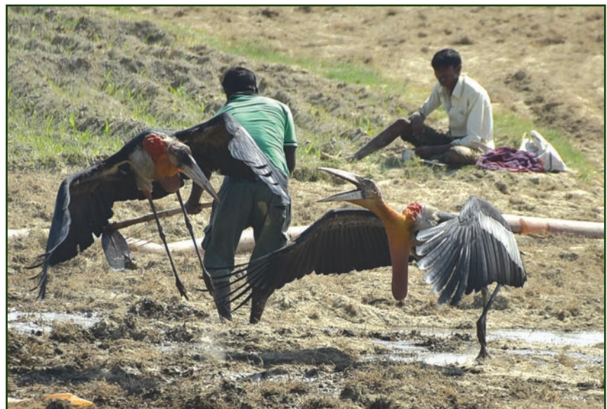
Endangered Greater adjutant storks thrive through community protection near Bhagalpur, Bihar

The following principles are laid down by the Framework (with descriptions or definitions contained therein):