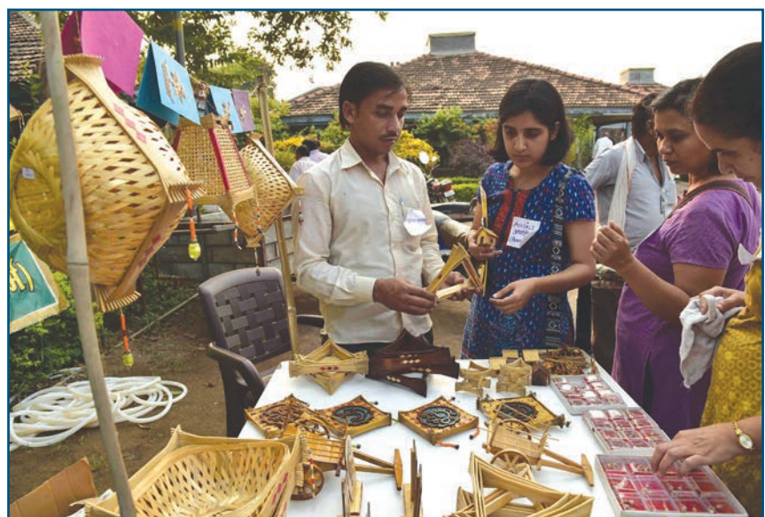
Bamboo products can be a major source of livelihoods for millions, sustainably harvested from community-governed forests

The Framework points to a caution that is important in the current context of an increasingly right-wing agenda supported by the state: that initiatives which appear to be alternative in one dimension, e.g. conservation, or sustaining appropriate traditions against the onslaught of wholesale modernity, would not be considered so if they have casteist, communal, sexist, or other motives and biases related to social injustice and inequity, or those appealing to a parochial nationalism intolerant of other cultures and peoples.