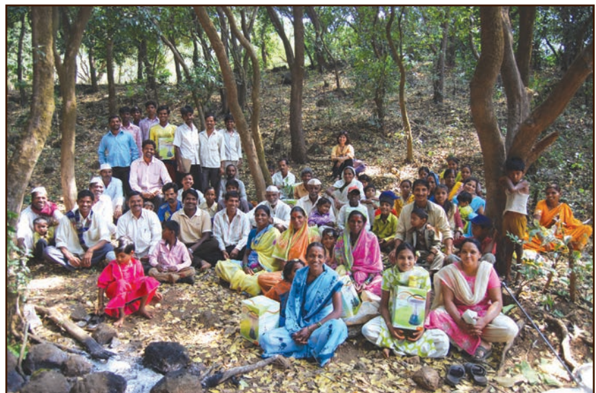
Villagers in Bhimashankar Sanctuary, Maharashtra: forest rights, forest-based livelihoods, planning the future, facilitated by Kalpavriksh

While the Framework lists such strategies and actions in a rather dry way, it is based on the knowledge