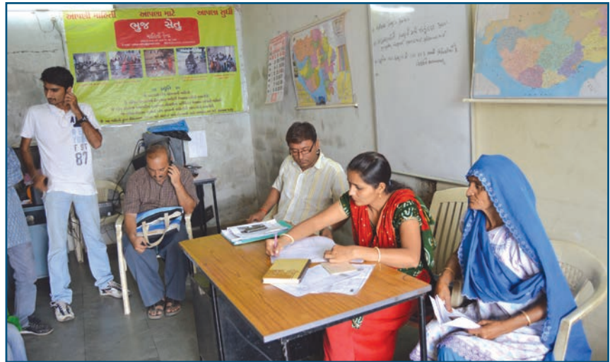
Urban SETU empowers citizens towards self-governance and greater government accountability, in Bhuj (Kachchh)

Some examples reflect the above. The 30-year old story of Mendha-Lekha, a village that has taken control over its commons and declared that for itself, it is the government, is iconic. It has successfully enforced the long forgotten Maharashtra Gramdan Act of 1965. Through this act the villagers have donated their entire agricultural land to the village Gram Sabha to strengthen it and also secure their land rights (Pathak and Gour-Broome 2001 and http://www.vikalpsangam.org/article/mendha-lekha-residents-gift-all-their-farms-to-gram-sabha/ ). A decade-long experiment at ecoregional decision making through a people's parliament ran in the Arvari basin in Rajasthan (Hasnat 2005). There