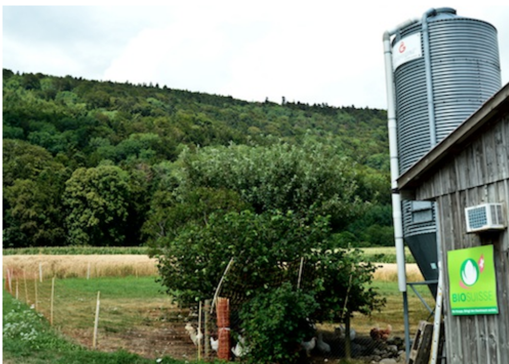
BioSuisse farm, Biel, Switzerland, cropped @Ashish Kothari

Phasing out fossil fuels and nuclear energy should be set as a time-bound target, and their replacement by renewables, with high priority to decentralised sources and generation which can be built and managed locally. Highest priority should be given to regions/populations currently starved of clean energy.