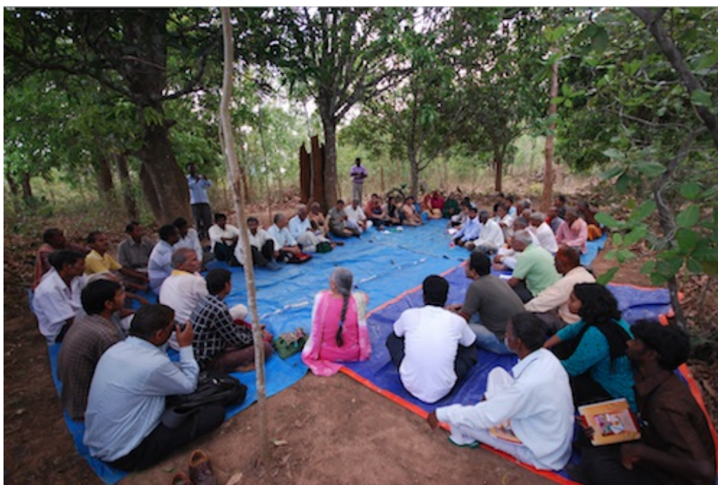
Village & civil society consultation on CFRs, Odisha, India.